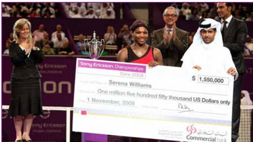
Serena Williams finished the 2009 season by winning the Sony Ericsson Championships – Doha 2009 as she clinched the year-end No.1 ranking.

Stunning breakthroughs by rising stars, rousing comebacks and an intense battle for No.1 provided the defining moments on the Sony Ericsson WTA Tour in 2009. And it was all played out against the backdrop of the historic Roadmap circuit reforms and change at the top of the Tour's administration.