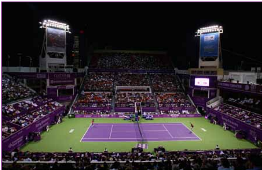
The year-end Sony Ericsson Championships have been held in Doha, Qatar.