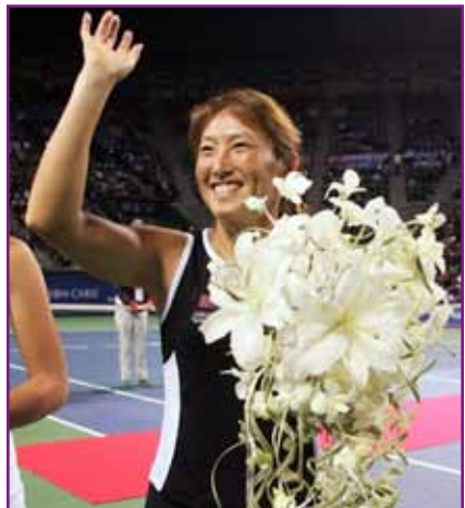
Ai Sugiyama, who played her first professional match in 1990 announced her retirement at the Toray Pan Pacific Open in Tokyo in October.