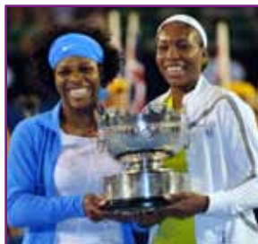
Serena Williams (L), Venus Williams