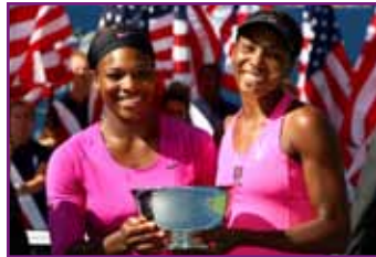
Serena Williams (L), Venus Williams