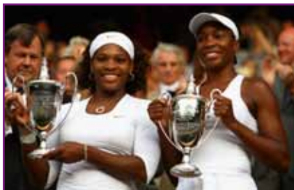
Serena Williams (L), Venus Williams