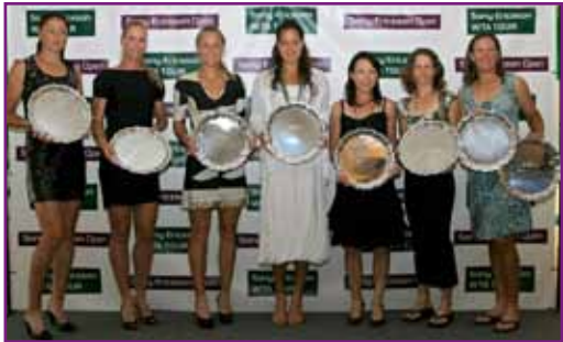
2008 Award winners (L-R) Dinara Safina, Elena Dementieva, Caroline Wozniacki, Ana Ivanovic, Zheng Jie, Cara Black and Liezel Huber pose with their 2008 Sony Ericsson WTA Tour Player Award during day four of the Sony Ericsson Open on March 26, 2009 in Key Biscayne, Florida.

As well as voting to honor Elena Dementieva with the Karen Krantzcke Sportsmanship Award, players named the Porsche Tennis Grand Prix (Stuttgart) as their Favorite Premier Tournament and the Commonwealth Tennis Tournament in Bali as Favorite International Tournament.