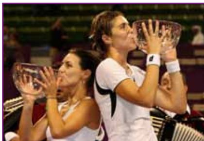
Nuria Llagostera Vives (L), Maria Jose Martinez Sanchez