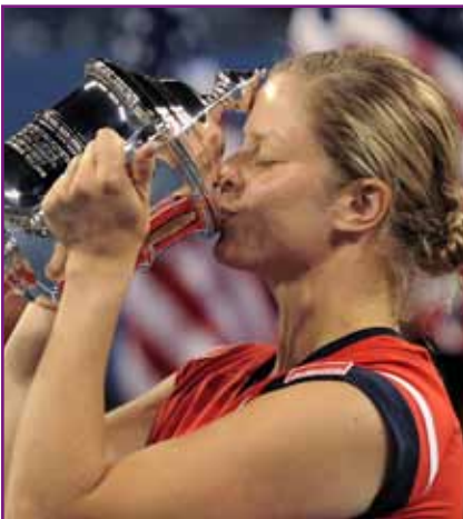
Kim Clijsters returned to win the 2009 US Open in her third tournament back after two years away.

Will Serena maximize her reign by delivering week in, week out in 2010 and beyond or will Safina capture that elusive Slam and the top ranking with it? Already safely back in the Top 20, how high will Clijsters fly - and what impact will the much-anticipated return of another celebrated Belgian, Justine Henin, have? While the success of the Roadmap must ultimately be measured by longer, healthier careers and fewer premature retirements, it cannot be denied such comeback stories give heart to the Tour's history.