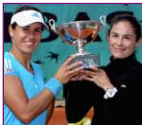
Anabel Medina Garrigues (L), Virginia Ruano Pascual