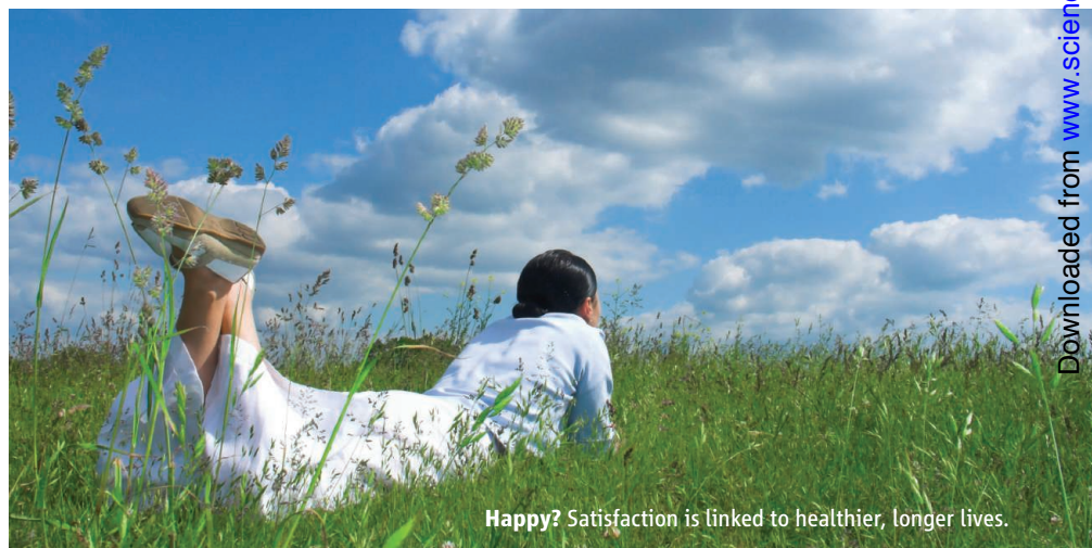
Happy? Satisfaction is linked to healthier, longer lives.