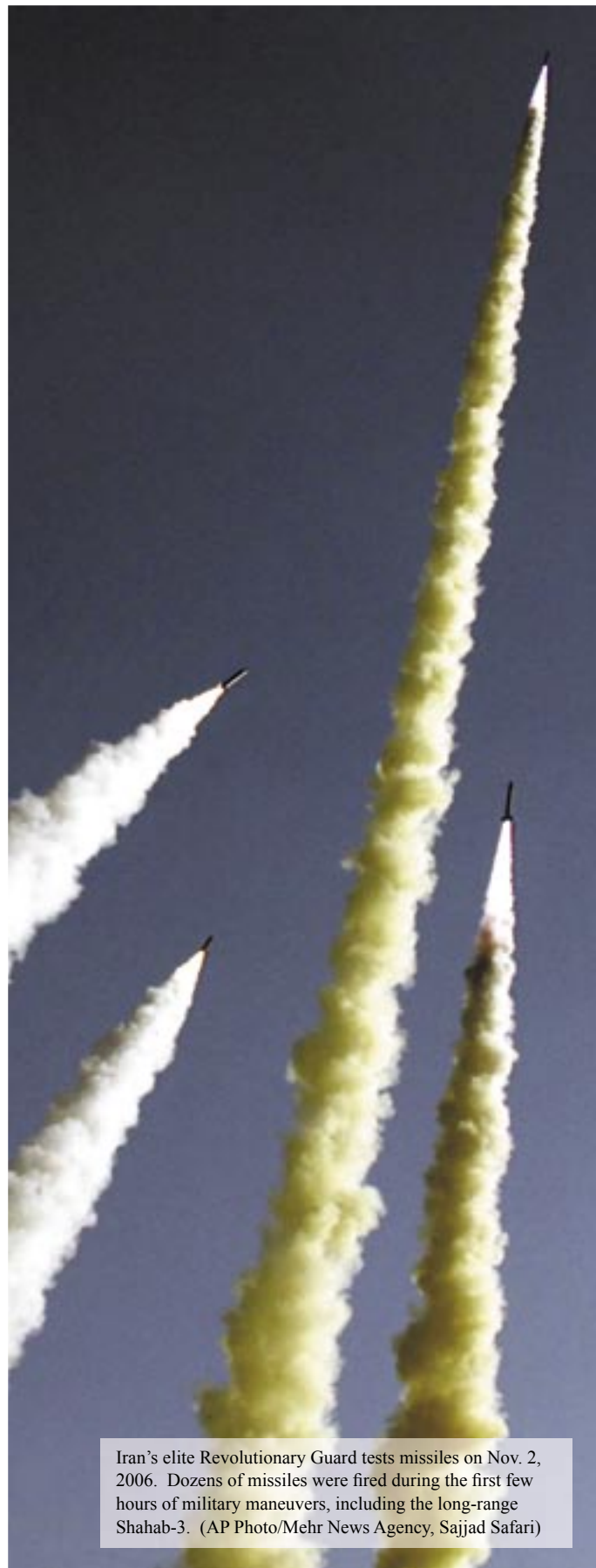
Iran's elite Revolutionary Guard tests missiles on Nov. 2, 2006. Dozens of missiles were fired during the first few hours of military maneuvers, including the long-range Shahab-3.

Genocide was the foremost cause of preventable death and suffering during the last century. 199 The new century can be much less perilous. This Monograph seeks to generate international attentiveness pertaining to Iran's violations of the requisites for U.N. membership and the central role of the Iranian President in incitement to genocide. As demonstrated supra , Ahmadinejad has repeatedly violated international treaties and customary international law pertaining to genocide. He has also, time after time, violated national laws pertaining to Holocaust denial and related hate crimes. As a consequence, there exist a multiplicity of potential prosecutors and legal venues that are available to commence legal action. Bluntly put, Ahmadinejad's incitement necessitates an indictment.