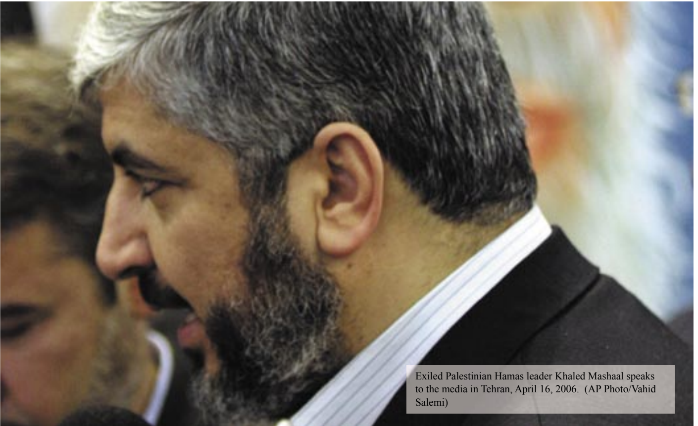
Exiled Palestinian Hamas leader Khaled Mashaal speaks to the media in Tehran, April 16, 2006.