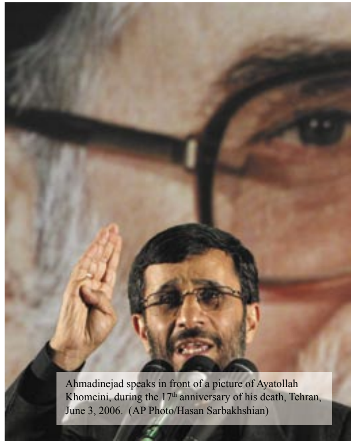
Ahmadinejad speaks in front of a picture of Ayatollah Khomeini, during the 17 th anniversary of his death, Tehran, June 3, 2006.

Should Ahmadinejad be prosecuted, and should he be found guilty, the matter will not be closed. There is also what is referred to as state responsibility, which might be incurred by Iran. This will be briefly dealt with infra in Section VI.