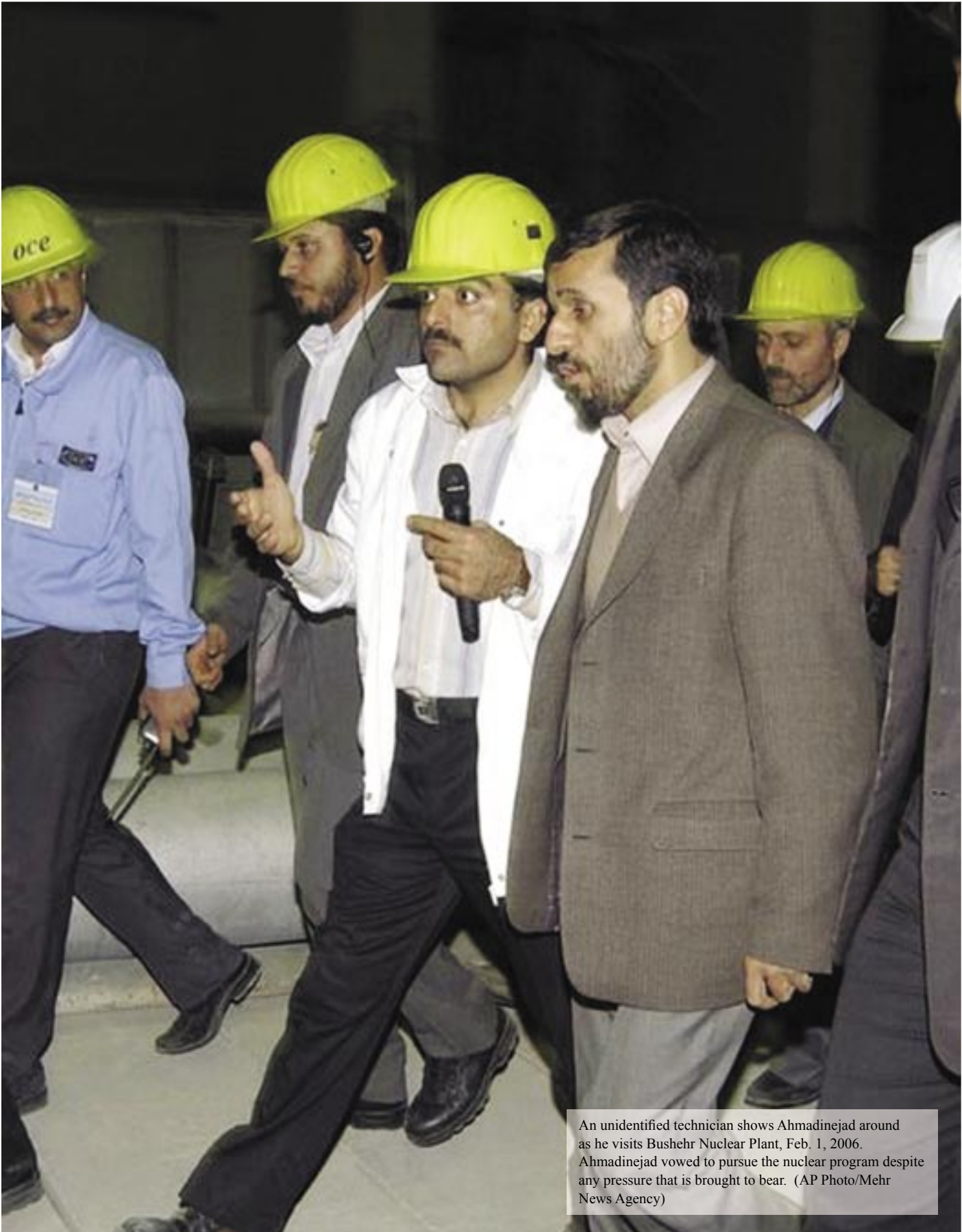
An unidentified technician shows Ahmadinejad around as he visits Bushehr Nuclear Plant, Feb. 1, 2006. Ahmadinejad vowed to pursue the nuclear program despite any pressure that is brought to bear.