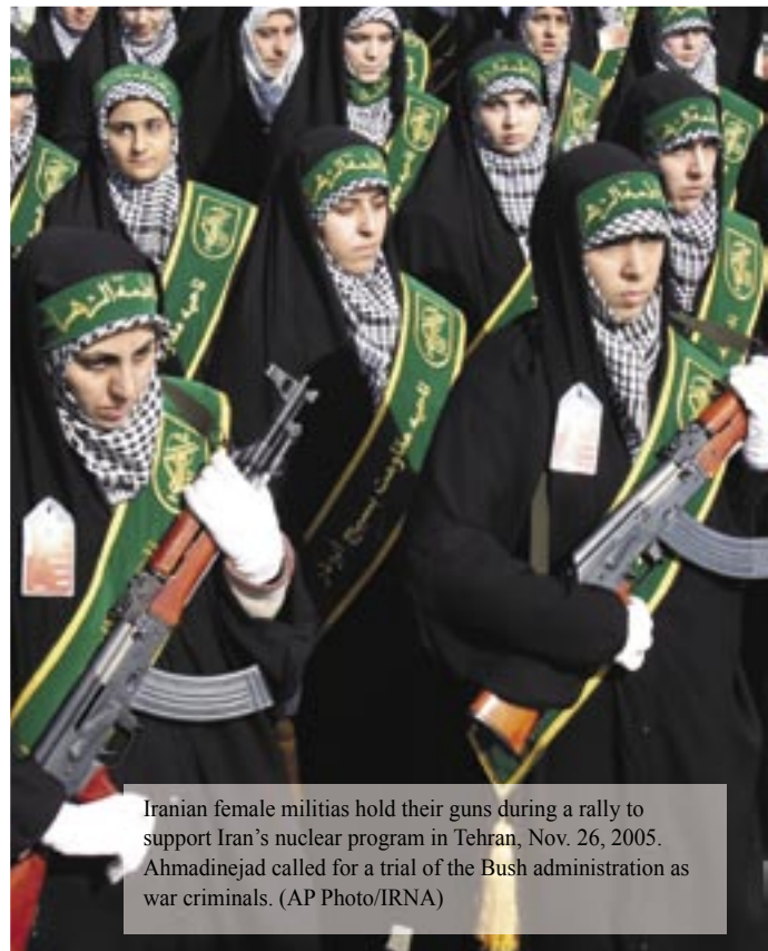
Iranian female militias hold their guns during a rally to support Iran's nuclear program in Tehran, Nov. 26, 2005. Ahmadinejad called for a trial of the Bush administration as war criminals.