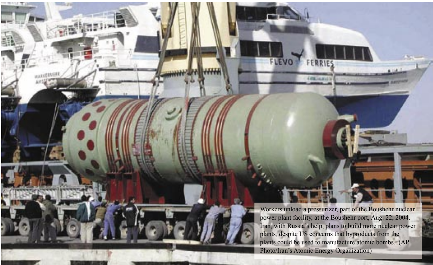
Workers unload a pressurizer, part of the Boushehr nuclear power plant facility, at the Boushehr port, Aug. 22, 2004. Iran, with Russia's help, plans to build more nuclear power plants, despite US concerns that byproducts from the plants could be used to manufacture atomic bombs.