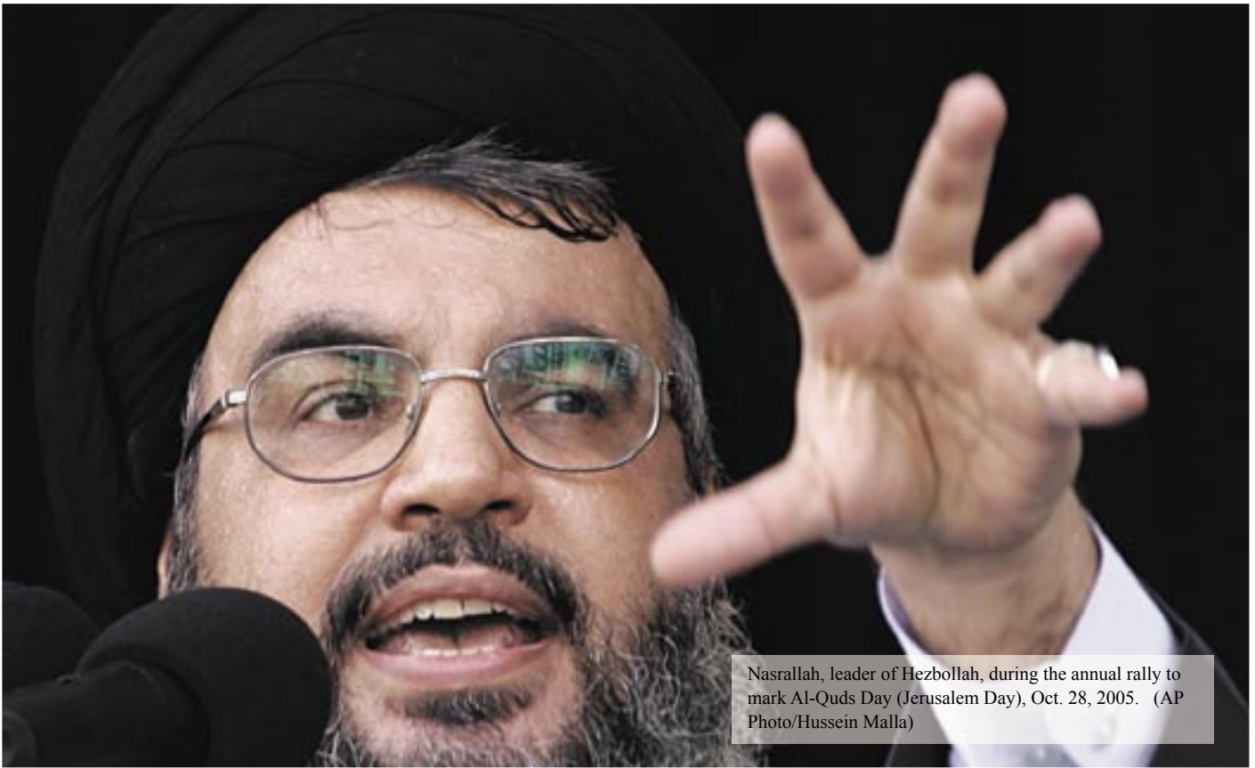
Nasrallah, leader of Hezbollah, during the annual rally to mark Al-Quds Day (Jerusalem Day), Oct. 28, 2005.