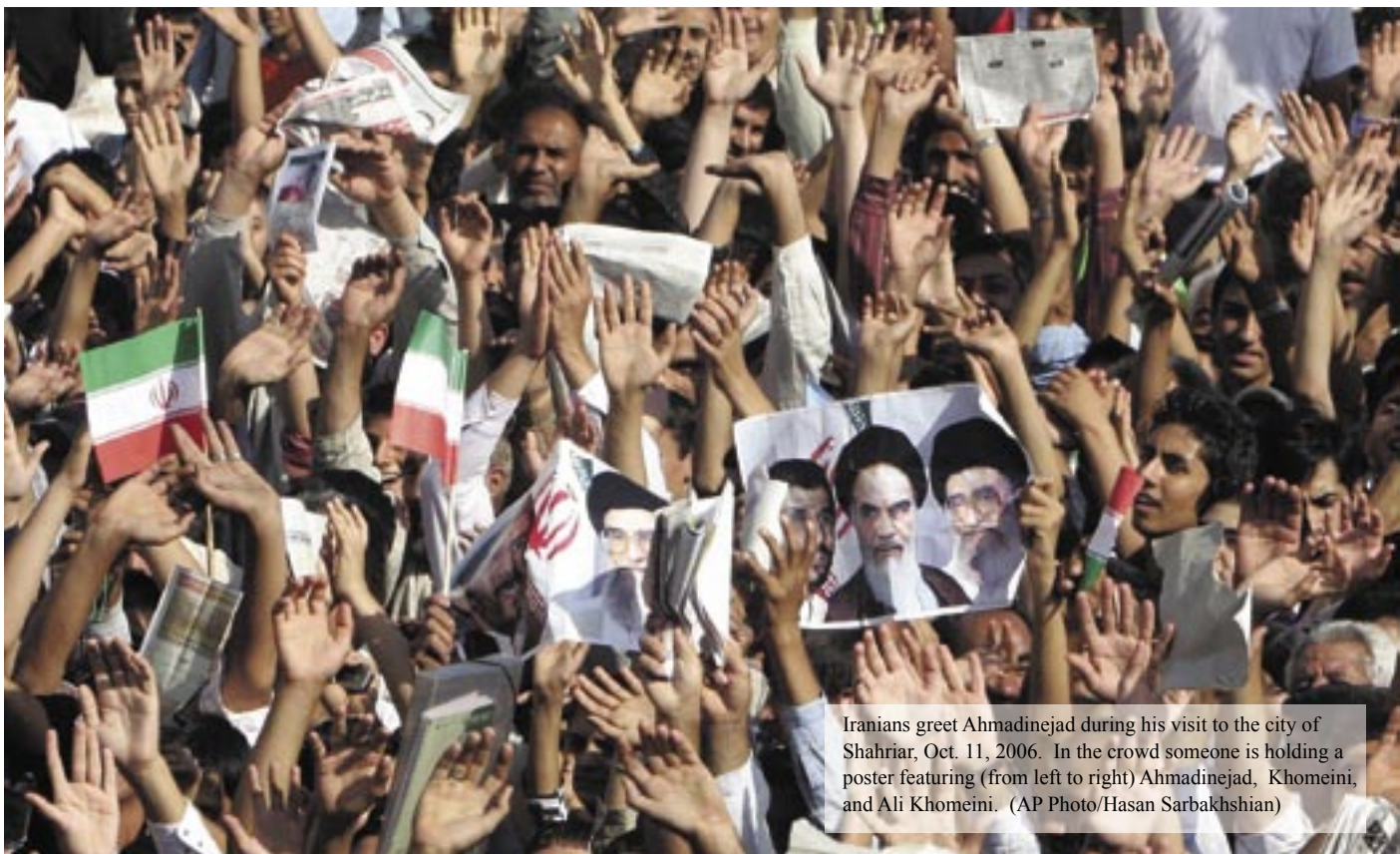
Iranians greet Ahmadinejad during his visit to the city of Shahriar, Oct. 11, 2006. In the crowd someone is holding a poster featuring (from left to right) Ahmadinejad, Khomeini, and Ali Khomeini.