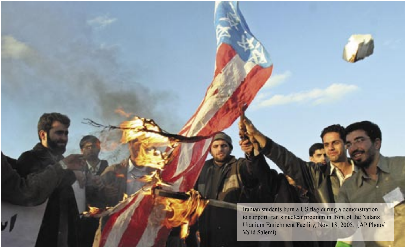
Iranian students burn a US flag during a demonstration to support Iran's nuclear program in front of the Natanz Uranium Enrichment Facility, Nov. 18, 2005.