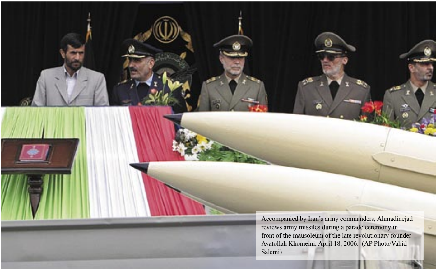
Accompanied by Iran's army commanders, Ahmadinejad reviews army missiles during a parade ceremony in front of the mausoleum of the late revolutionary founder Ayatollah Khomeini, April 18, 2006.