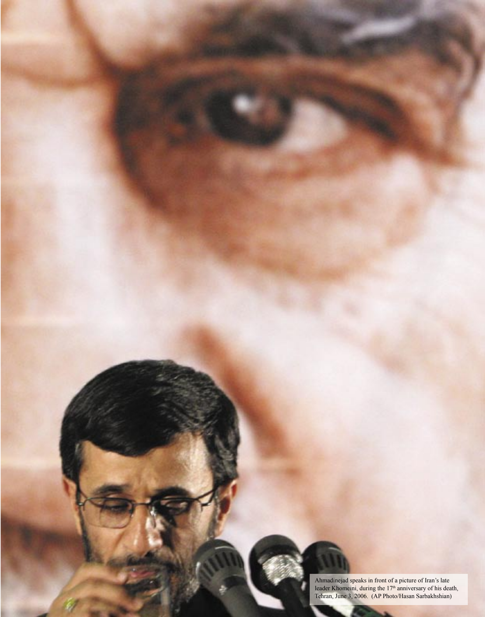
Ahmadinejad speaks in front of a picture of Iran's late leader Khomeini, during the 17 th anniversary of his death, Tehran, June 3, 2006.