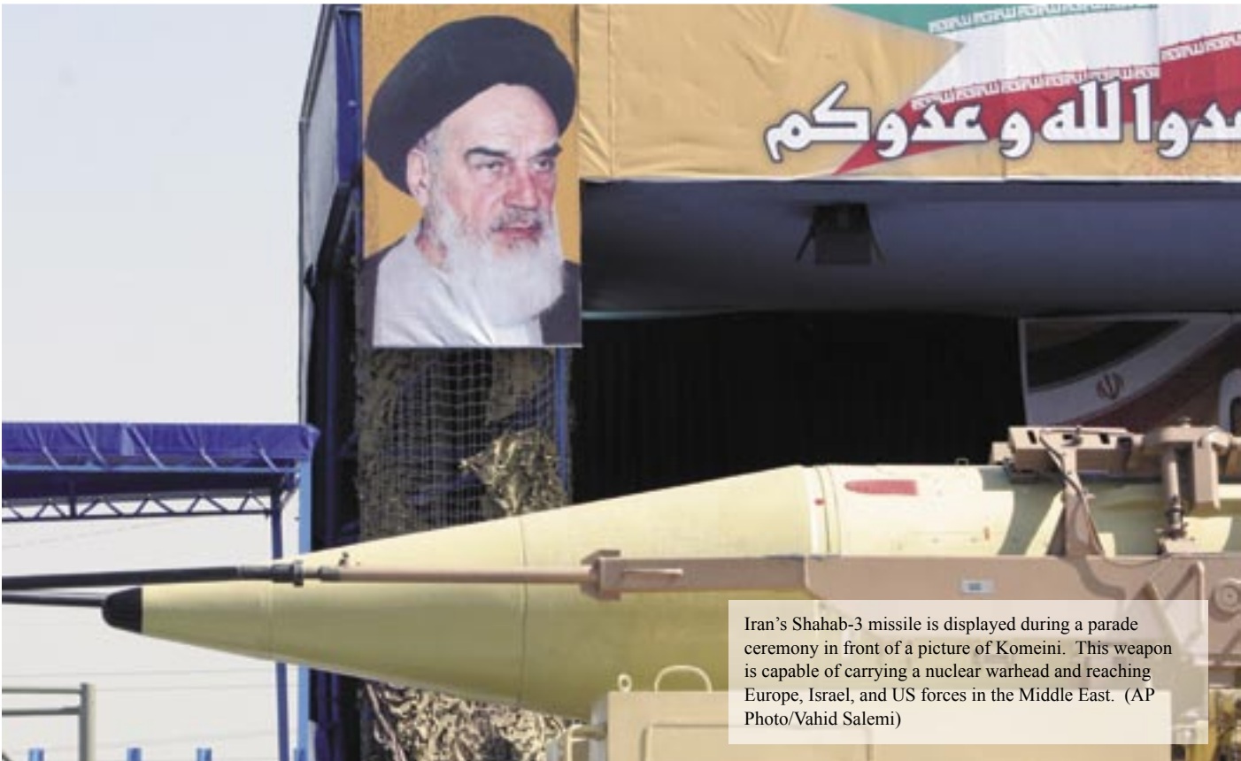
Iran's Shahab-3 missile is displayed during a parade ceremony in front of a picture of Komeini. This weapon is capable of carrying a nuclear warhead and reaching Europe, Israel, and US forces in the Middle East.