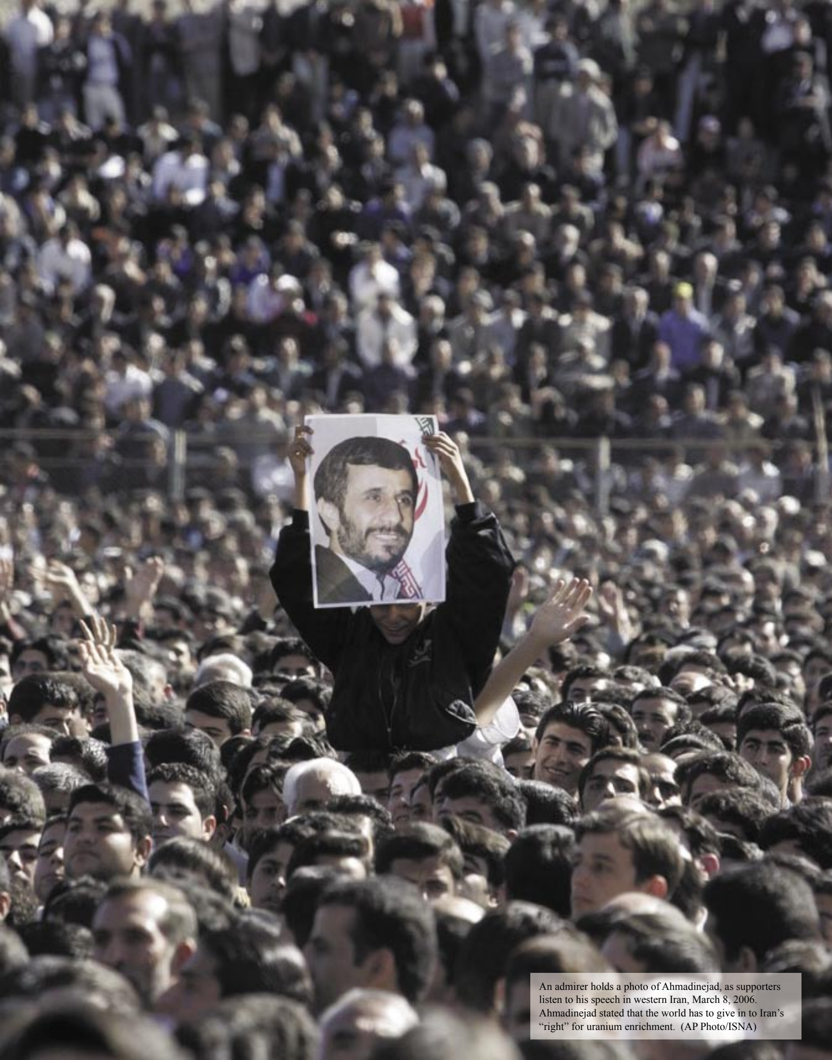
An admirer holds a photo of Ahmadinejad, as supporters listen to his speech in western Iran, March 8, 2006. Ahmadinejad stated that the world has to give in to Iran's "right" for uranium enrichment.