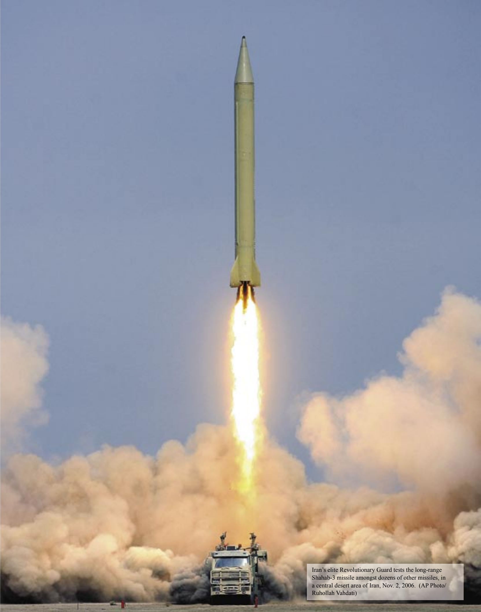
Iran's elite Revolutionary Guard tests the long-range Shahab-3 missile amongst dozens of other missiles, in a central desert area of Iran, Nov. 2, 2006.