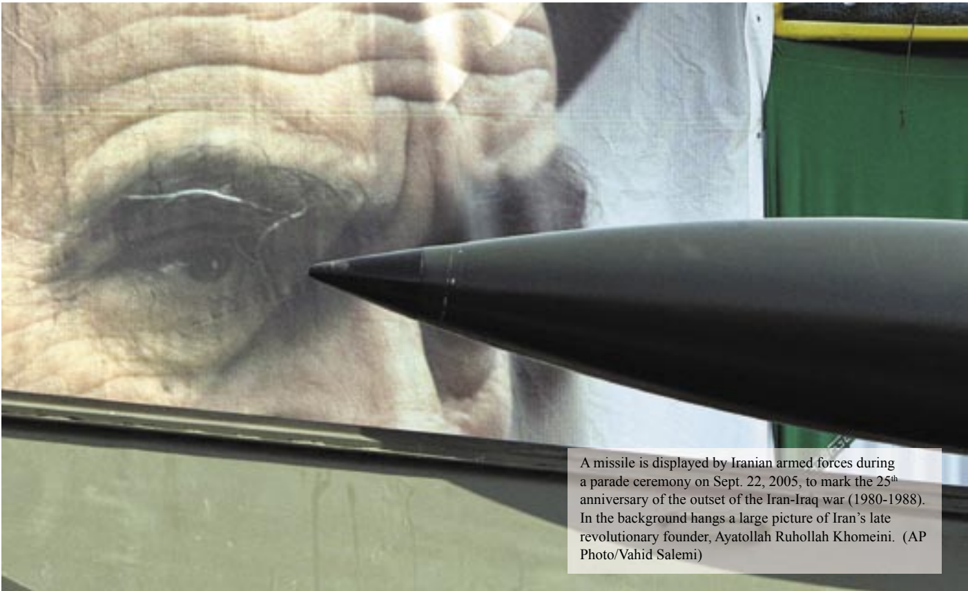
A missile is displayed by Iranian armed forces during a parade ceremony on Sept. 22, 2005, to mark the 25 th anniversary of the outset of the Iran-Iraq war (1980-1988). In the background hangs a large picture of Iran's late revolutionary founder, Ayatollah Ruhollah Khomeini.