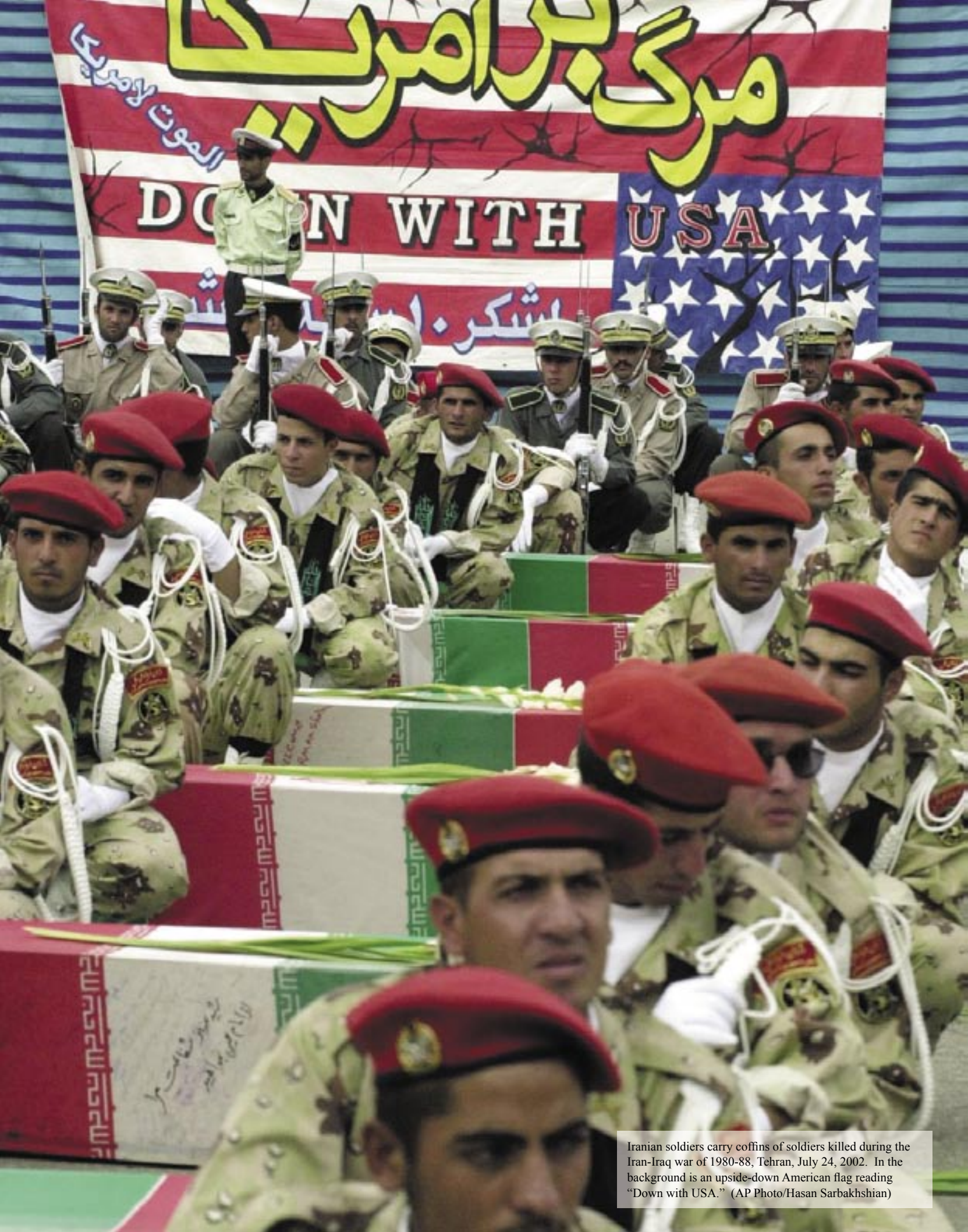
Iranian soldiers carry coffins of soldiers killed during the Iran-Iraq war of 1980-88, Tehran, July 24, 2002. In the background is an upside-down American flag reading "Down with USA."