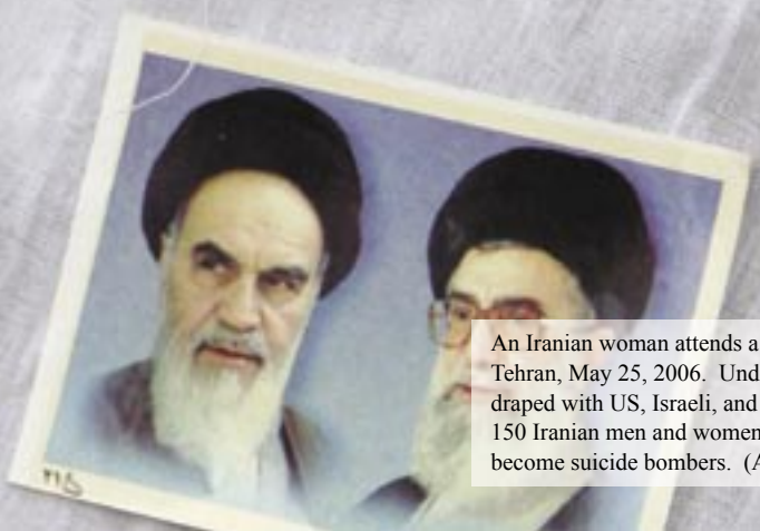
An Iranian woman attends a suicide bombers gathering in Tehran, May 25, 2006. Under a banner showing coffins draped with US, Israeli, and British flags, more than 150 Iranian men and women pledge their willingness to become suicide bombers.