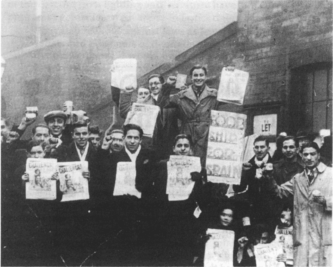
Manchester Jewish anti-fascists demonstrate in support of Republican Spain, circa 1937.

to the need for a political struggle against anti-semitism. Such a struggle will inevitably have to take place on the level of emotionality as well as intellectuality. It will have to defeat the mass psychology of fascism and anti-semitism