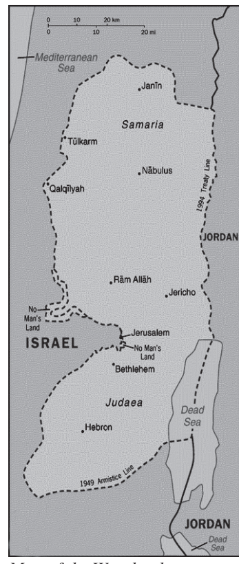
Map of the West bank

raeli soldiers using the ambulances in their raids against Palestinians.