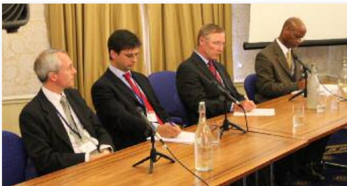
Conference speakers answer questions

factors which have contributed to family breakdown in the United Kingdom. These include: