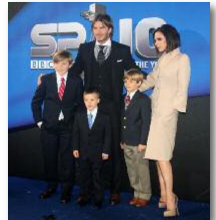
David Beckham with wife and children

British population-control fanatics are once again showing their irrationality and true totalitarian colors by using the birth of a fourth child to English football star David Beckham and his wife to climb on their Malthusian soapboxes.