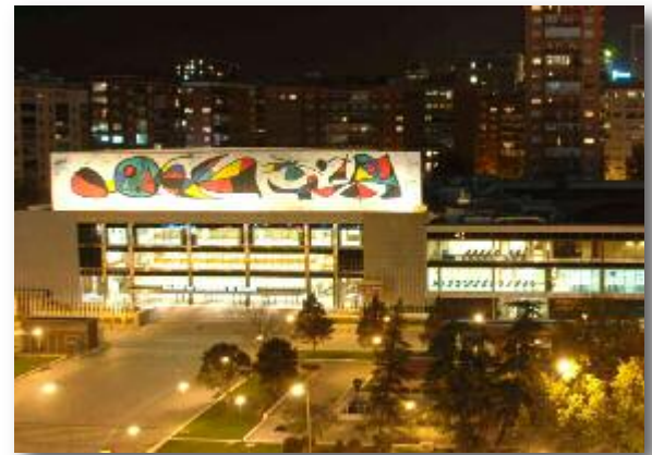
Palacio De Congresos at night