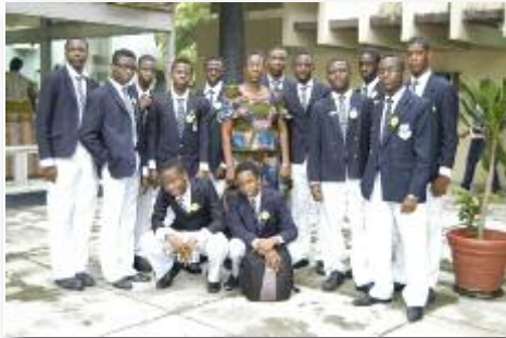
Students from Kings College, Lagos