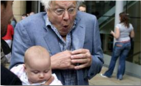
Sir David Attenborough, patron of the Optimum Population Trust, is scared of a world with too many kids