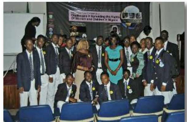
Nigerian students attending conference

Government leaders, social workers, lawyers, educators, and international experts gathered in Lagos to discuss how best to protect women and children. Other issues relevant to Africa that were discussed in depth included child marriage, child abuse, trafficking in women and children, maternal mortality, and inheritance rights of women. Sad cases of children who had been abused or trafficked were shared by several speakers.