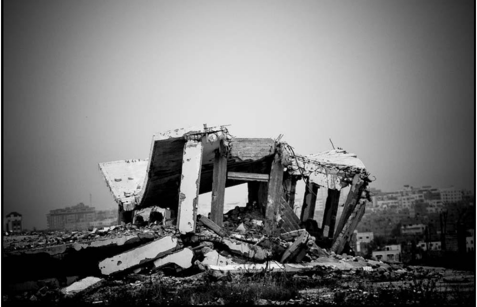
Khan Yunis, Gaza 2006

Israel's participation at DSEi is organised by SIBAT, a department of the Israeli government responsible for the IDF's arms procurement.