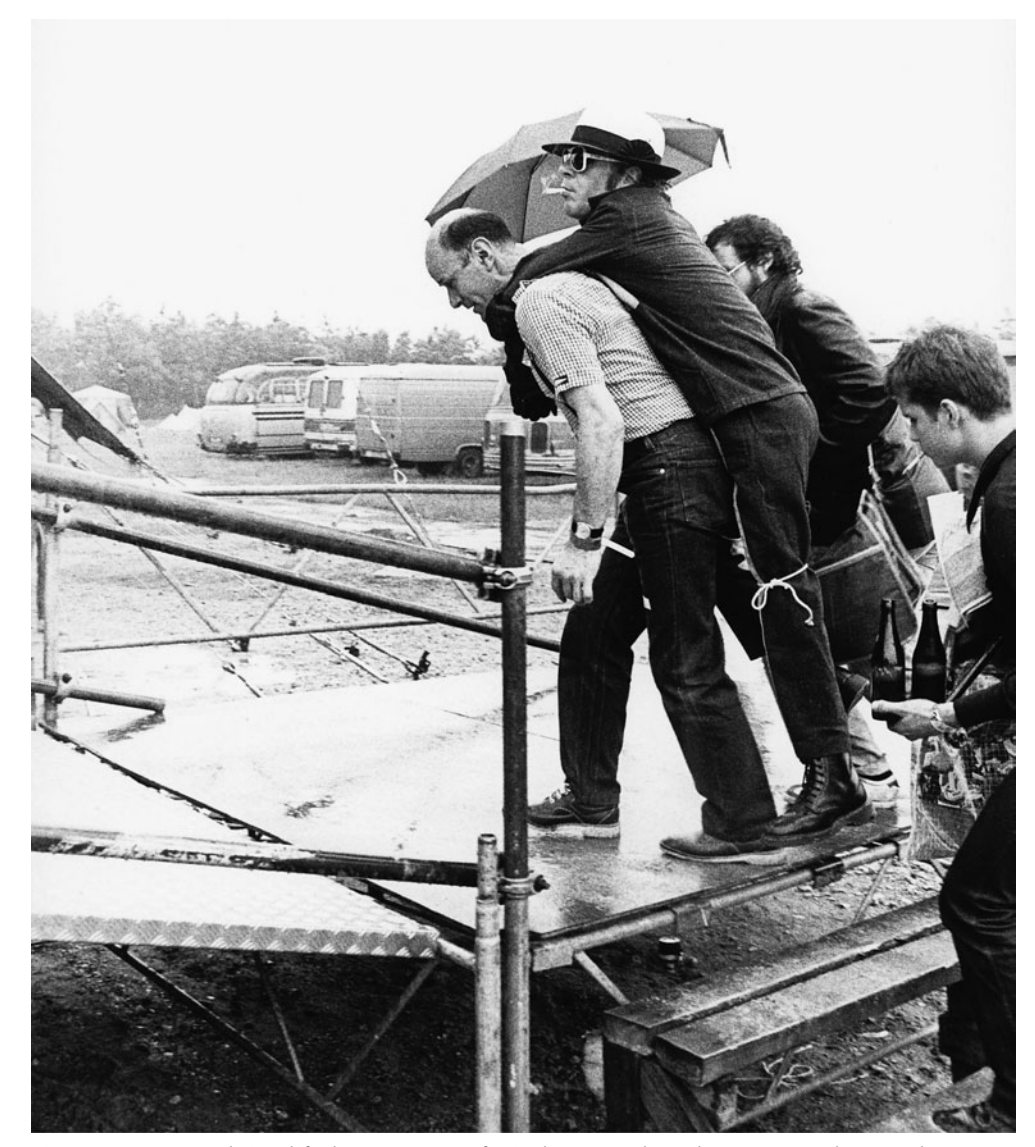
Figure 4. Ian Dury being lifted on stage at a festival, Denmark, early 1980s.