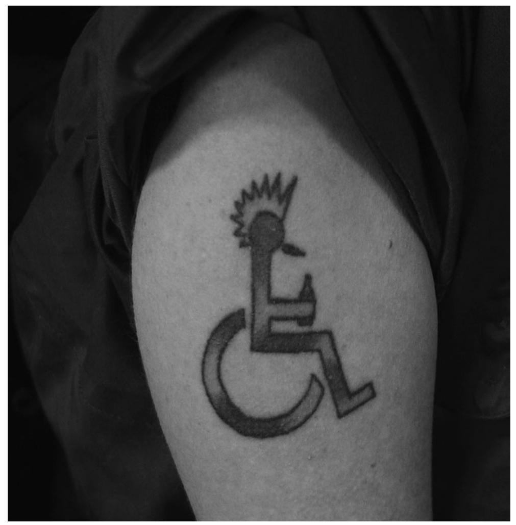
Figure 5. Disability, identity, the body, subculture: a disabled punk's tattoo.