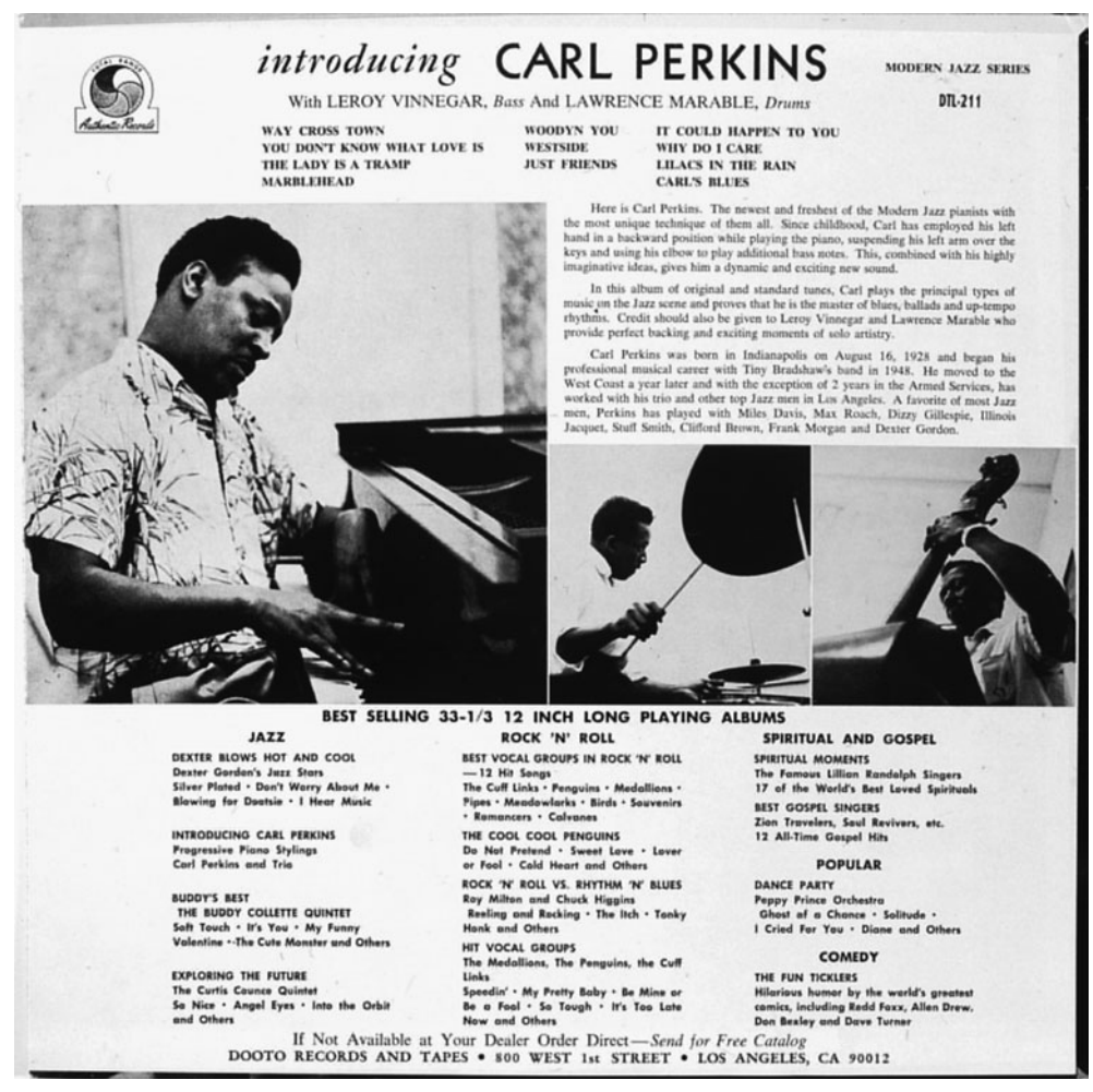
Figure 3. Back cover of 1956 LP, Introducing ... Carl Perkins. © Ace Records Ltd, London. Used with permission.

time think it's out of tune, but it would be more accurate to say he plays in an alternative tuning. (Palmer 2004)