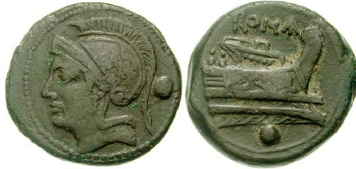
Figure 3. Roman coin of 217–216 B.C. (Sear, Roman Coins & their Values [2000 Edition] #615). The single dot or pellet to the right of the head of Roma and below the prow of the ship indicates that the value is an uncia.

Sextula. 1) a) Römisches Gewicht, \frac{1}{6} der Uncia, \frac{1}{72} des Pfundes ( libra ) bzw. pfündigen Kupferasses. Stellennachweise Hultsch Metrol. scr. II Ind. s. v. Moderner Gewichtswert etwa 4,45 g. Die gewöhnliche Schätzung zu 4,548 g (Hultsch Metrol. 2 706 Taf. XIII A) greift zu hoch. Zeichen ⊙ , Hultsch Metrol. script. II 10 xxviii; Metrol. 2 147f.