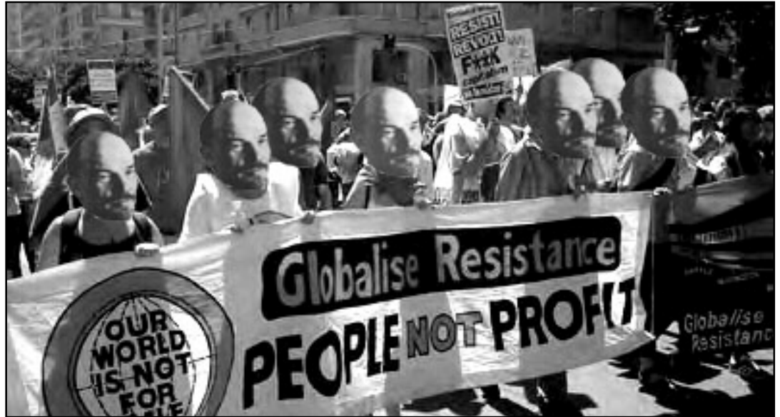
Globalise Resistance in Genoa - without the masks.