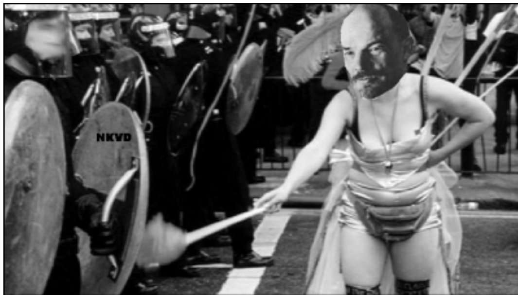
Lenin inspects the troops. Now they are ready to defend capitalism.

Make them feel part of Globalise Resistance by giving them some tacky shite with our logo on like badges or t-shirts. That'll impress them.