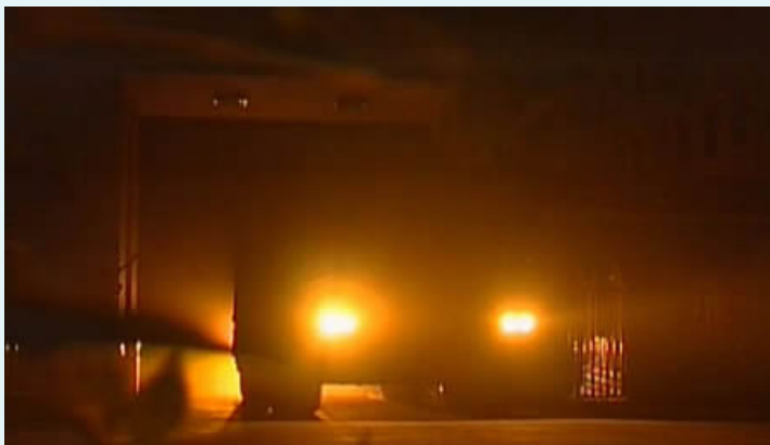
A Chinese mobile missile launcher, possibly for the DF-11 or DF-15 SRBM, emerges from an underground facility at an unknown location.

The Pentagon report states that China has “developed and utilized UGFs [underground facilities] since deploying its oldest liquid-fueled missile systems and continue today to utilize them to protect and conceal their newest and most modern solid-fueled mobile missiles.” So it is not new but it is also being used for modern missiles.