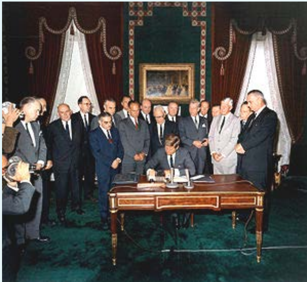
President Kennedy signing Nuke Test Ban Treaty in 1963

TOKYO, Aug 15, 2011 (IDN) - When the world commemorates the International Day against Nuclear Tests for the second time on August 29, it would have reasons to rejoice at the progress made toward a nuclear-weapon-free world, and at the same time take note of roadblocks ahead before that goal is achieved.