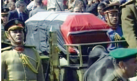
Coffin escorted by military personnel on its way to Almaza Airbase in Cairo (12 Nov.) ▲