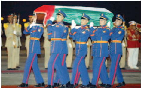
Egyptian honor guards carry Arafat's casket upon arrival in Cairo (11 Nov.) ▲