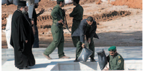
Soil brought from Al-Aqsa Mosque in Jerusalem by Muslim-Christian religious figures is added to Arafat's grave (12 Nov.)▲