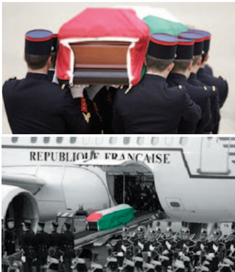
Arafat's coffin draped with the Palestinian flag is carried by French military honor guards at Villacoublay air base near Paris and loaded onto a French airplane flying to Cairo (11 Nov.) ▲