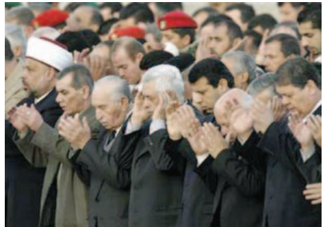
Palestinian leaders praying at Arafat's grave (13 Nov.) ▲