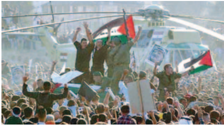
Crowds of Palestinian mourners attend the funeral in Ramallah where Arafat is laid to rest at the Muqata'a (12 Nov.) ▲