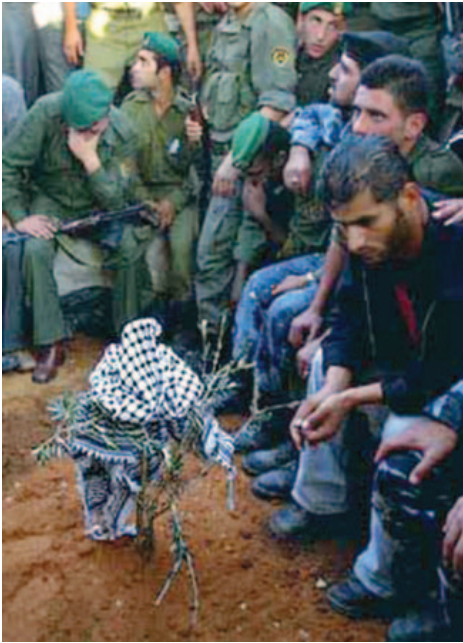
Four olive trees uprooted from the yard of Al-Aqsa Mosque together with a sprinkle of Jerusalem soil are placed at the burial site of late President Yasser Arafat (12 Nov.) ▲