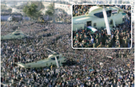
Palestinian crowds watch the Egyptian helicopters landing at the Muqata'a, Ramallah, with the casket of their late President on his final trip home (12 Nov.) ▲