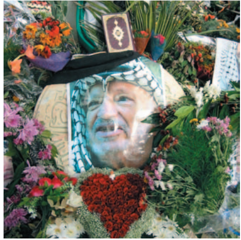
Close-up photo of Arafat's grave (13 Nov.) ▲