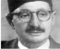
Abdel-Raouf Arafat Al-Qudwa Al-Husseini

Aug. 4, 1929: Yasser Arafat is born in Cairo as Mohammed Abdel-Raouf Arafat Al-Qudwa Al-Husseini, and as fifth of seven children of a Palestinian merchant. ▶