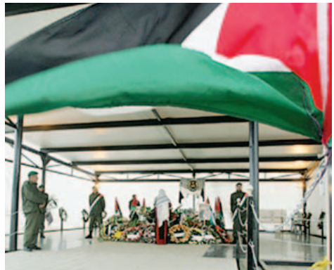
Arafat's mausoleum [ مزار عرفات ] at the Muqata'a in Ramallah, (Nov. 2004) ▲