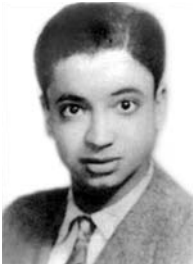
Mohammed Abdel-Raouf Arafat Al-Qudwa Al-Husseini

1933: Arafat's Mother Zahwa dies; he and infant brother Fathi are sent to Jerusalem to live with an uncle. ◀