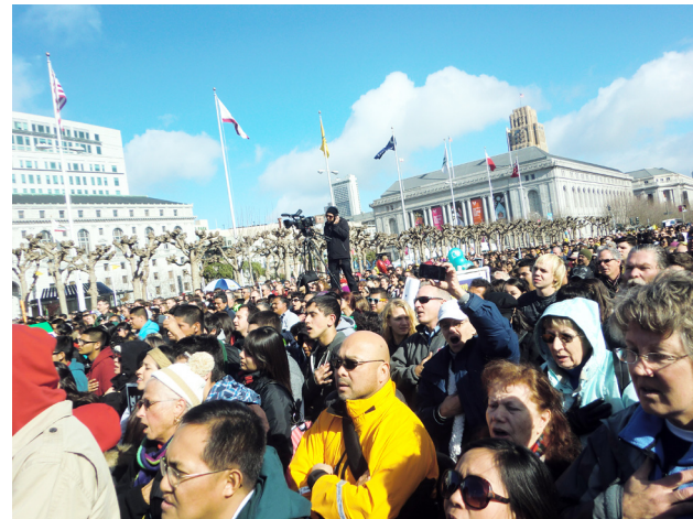
Walk For Life 2012 San Francisco, California