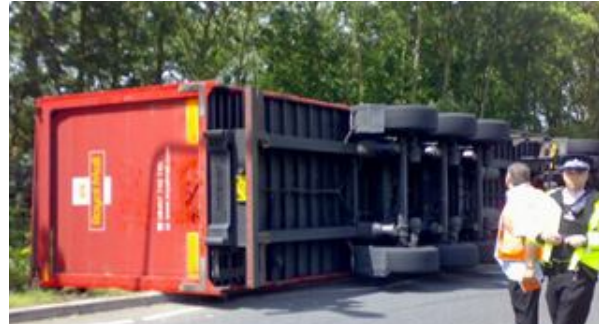
who claimed scab managers can't drive?!