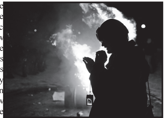
A demonstrator stands near a burning structure

According to Occupy the Press, citizen journalists covering the Occupation, the demonstration