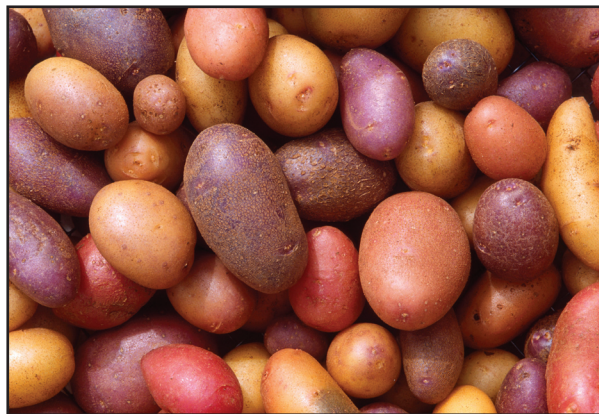
There are more than 250 species of wild potatoes around the world.