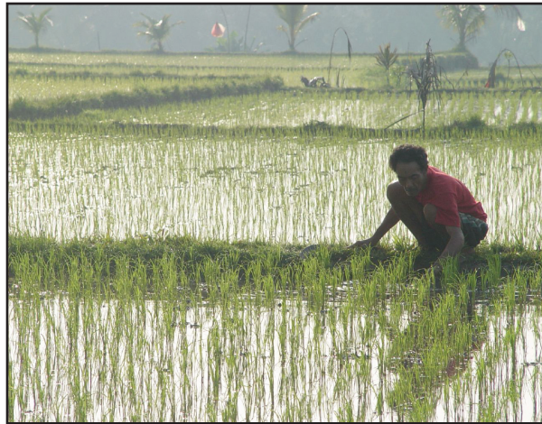
Rice paddies, Bali, Indonesia. Rice first originated in Asia but is now grown all around the world.