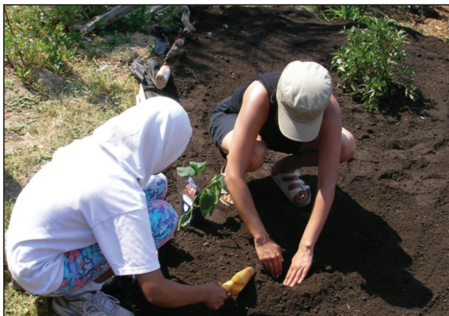
Canadian students begin a school garden project.

For more information please go to: www.lsf-lst.ca or www.ecoleague.ca .