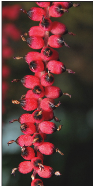
Aechmea.