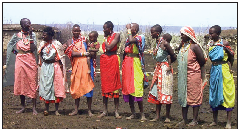
Masaai women.