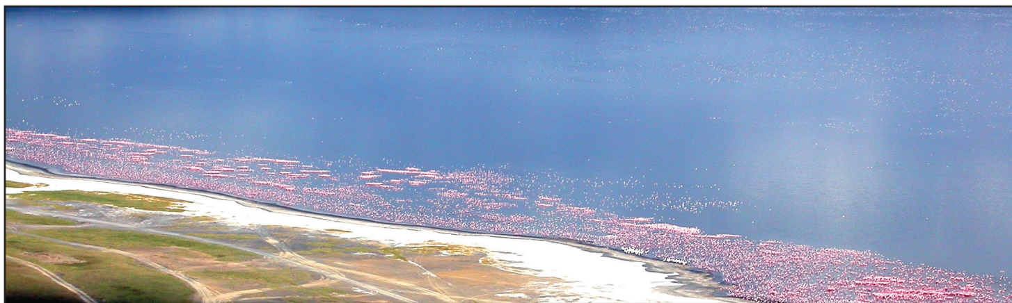
Flamingos in Lake Nakuru, Kenya.

Cada año, el CDB crea una colección para grupos informativa y divertida para celebrar el Día Internacional de la Diversidad Biológica. Si a tu escuela le gustaría recibir la colección de 2008, por favor envíe tu solicitud a christine.gibb@cdb.int o al Convenio sobre la Diversidad Biológica, c/o Christine Gibb, 413 Rue St. Jacques O, Suite 800, Montreal Québec, H2Y 1N9, Canadá. Las colecciones se incluirán dentro de nuestra página Internet a partir de abril de 2008, y serán enviadas al mismo tiempo. Asegúrate de incluir el nombre y dirección de tu escuela y de la persona responsable.