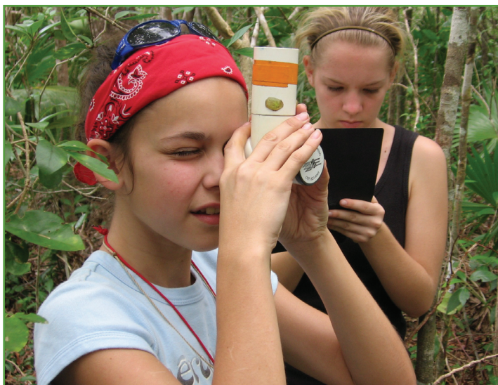
Student participants collect data as part of their ecological studies.

Students attending the "Youth Symposium on Biodiversity" submitted project abstracts regarding the conservation work they are doing at their home sites. All worthy projects were accepted and funding was found for all to attend.