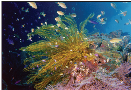
Coral reefs are sometimes called the 'tropical rainforests of the ocean' because of the biodiversity they house.

Reef Initiative (ICRI), a partnership among governments, international organizations (including the CBD), and non-governmental organizations throughout the world, has designated 2008 as the International Year of the Reef (IYOR 2008).