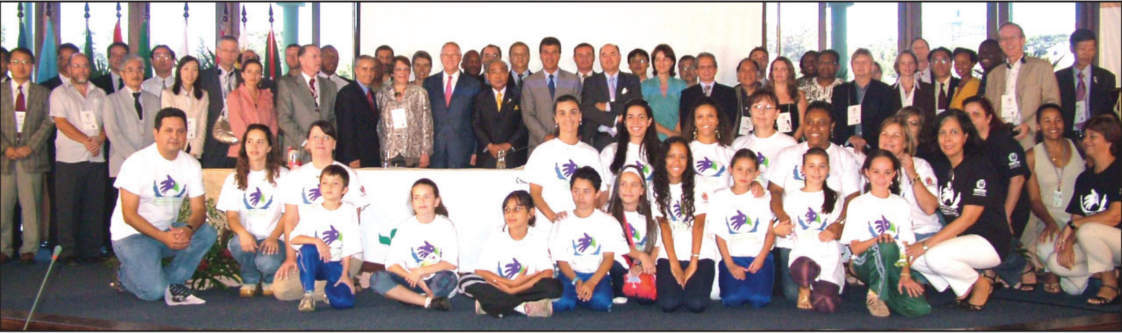
Children and youth of Curitiba sitting with delegates at the “Cities and Biodiversity: Achieving the 2010 Biodiversity Target” in Curitiba, Brazil.