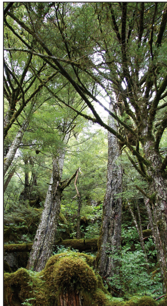
Tropical forest.

Graduate of Meyuns Elementary School, Koror, Palau