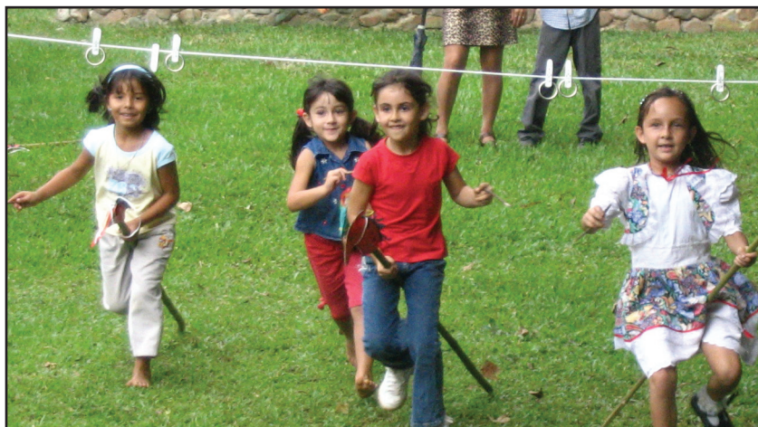
Costa Rican children celebrate at a village Biodiversity Centre.

In the first edition of Gincaniño , I called upon you, the children and youth, to adopt the spirit of the 2002 Youth Declaration. It is imperative for you, as the leaders of tomorrow, to become engaged in the international biodiversity agenda and to work to protect all life on Earth. You have responded enthusiastically to the challenge, and we at the Secretariat are delighted to support your initiatives.