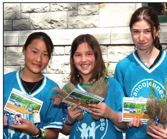
Students from Francojeunesse in Ottawa, Canada participate in a tree planting event to celebrate IBD and UNEP's Billion Tree Campaign.