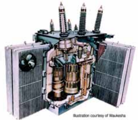
Illustration courtesy of Waukesha

To meet this need, Doble Global Power Services developed the world's first—and best—knowledge crash course on all aspects of large power transformers, from cradle to grave. The course has developed a reputation for excellence, attracting the top experts in the world who present their knowledge in a rather intense fashion. The topics are arranged in a natural flow pattern, beginning with specification and design of a new unit, and finishing at failure analysis and end-of-life issues, while encompassing virtually every relevant topic in between. There is no other seminar in the world like "The Life of a Transformer"!