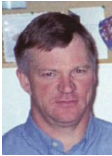
- by Peter Eggers

On November 23, 2010 I had an accident. While I was unloading a highboy trailer with a self-unloading bale rack for round bales, the top bale came over the end and hit me like lightning. I did not see it coming. It knocked me over and when it came to rest the pea straw bale with a weight of approximately 1600 lbs was lying on its side completely covering my right leg. It was -25° to -30 ° C. I decided not to faint and to dig myself out. I had to bite the sisal twine. I almost uncovered myself to the point that I could see my boot. I had called out for help, and a friend and neighbor found me. He rocked the bale and I got out, three to four hours after the accident. When I got into the ambulance to take me to the hospital, my body temperature was 33.5°C. The doctors tried to save my leg, but after one week my right leg was amputated at the knee. Due to some infection my stay was a little prolonged and I was released on January 4 th .