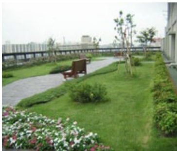
"A green roof on BROTHER INDUSTRIES, LTD." Mizuho Ward, Nagoya City, Japan

Cities and local authorities and their partners have a major role to play in promoting the positive impacts of integrating biodiversity into urban planning and development. Already, as