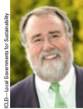
ICLEI—Local Governments for Sustainability

I therefore look forward to continuing to work with you in the lead-up to the tenth meeting of the Conference of the Parties (COP10) and the City Biodiversity Summit 2010, to be held as an associated event to COP10. 🌱