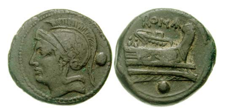
Figure 3. Roman coin of 217–216 B.C. (Sear, Roman Coins & their Values [2000 Edition] #615). The single dot or pellet to the right of the head of Roma and below the prow of the ship indicates that the value is an uncia.

Sextula. 1) a) Römisches Gewicht, <sup>1</sup>/<sub>6</sub> der Uncia, <sup>1</sup>/<sub>72</sub> des Pfundes ( libra ) bezw. pfündigen Kupferasses. Stellennachweise Hultsch Metrol. scr. II Ind. s. v. Moderner Gewichtswert etwa 4,45 g. Die gewöhnliche Schätzung zu 4,548 g (Hultsch Metrol.<sup>2</sup> 706 Taf. XIII A) greift zu hoch. Zeichen 2, Hultsch Metrol. script. II 10 xxvIII; Metrol.<sup>2</sup> 147f.