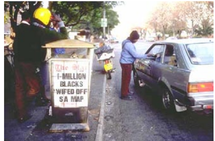
Whites dealt with their “demographic problem” through expulsion.