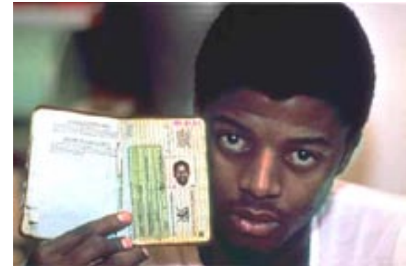
A worker shows his passbook.

In the 1950s, laws divided the 13.6 percent of the land that Whites had reserved for Black people into ten African “homelands” or Bantustans. A goal of the Apartheid system was to deprive Black Africans of South African citizenship and force them to be “citizens” of these fragmented and impoverished “homelands.” More than four million Black people were expelled from “White” areas and made to live in the desperately poor Bantustans.