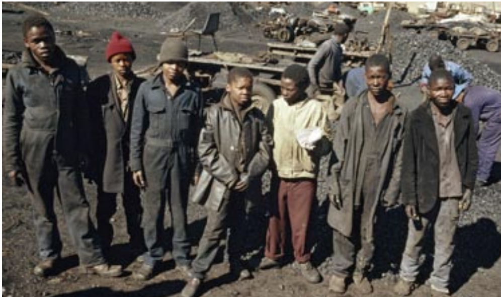
African laborers in a mining camp.

In 1976, South Africa declared that the Bantustans were now “independent states.” But the world refused to recognize them as such. In the eyes of the international community, the people who were forced to live there remained South Africans.