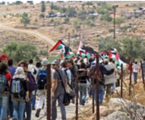
From the first intifada to the current weekly demonstrations against the Apartheid Wall, Palestinians have a rich history of nonviolent protest activity.

While Palestinian suicide bombings and Gaza's crude rockets have received world attention, less well known are the daily acts of non-violent resistance which Palestinians engage in with their Israeli and international supporters.