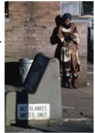
A “Whites Only” bench.

In Apartheid South Africa, people were classified as either “White” or “Non White” (Black, Colored or Asian). This classification determined where people could live, what kind of jobs they could get, what schools they could attend and what kind of rights they would have. As under “Jim Crow” segregation in the American South, the best of everything was reserved for “Whites Only.”