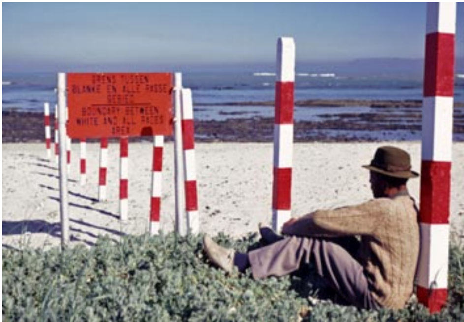
Under Apartheid people were separated by race.

“ Apartheid ” is the Afrikaner word for “apartness.” It reflected the racist belief that certain people are less human than others. White colonial rulers in South Africa set aside 87 percent of the best land for themselves. They wanted the labor of the majority indigenous Black population, but viewed Black Africans as a “demographic problem” whose numbers and movements had to be strictly controlled.