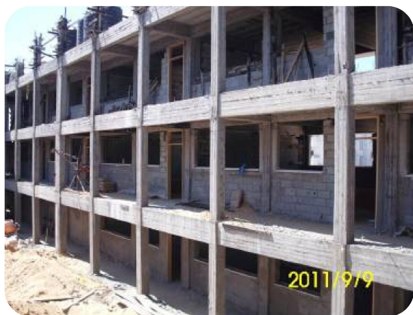
Construction of School in Tel Alwah by UNRWA