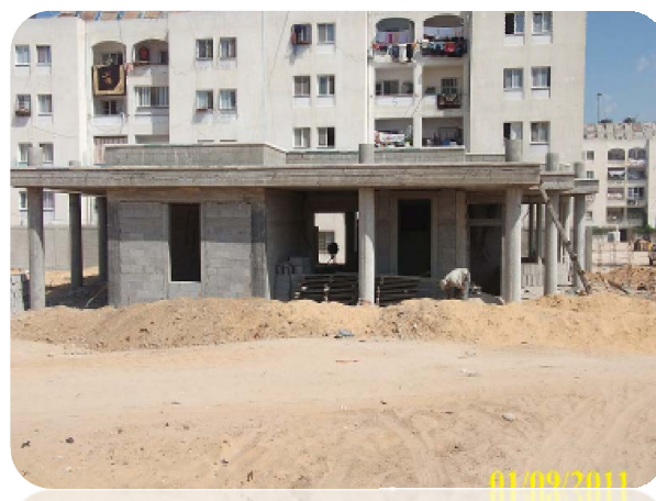
Construction of Kindergarten in Beit Hanun