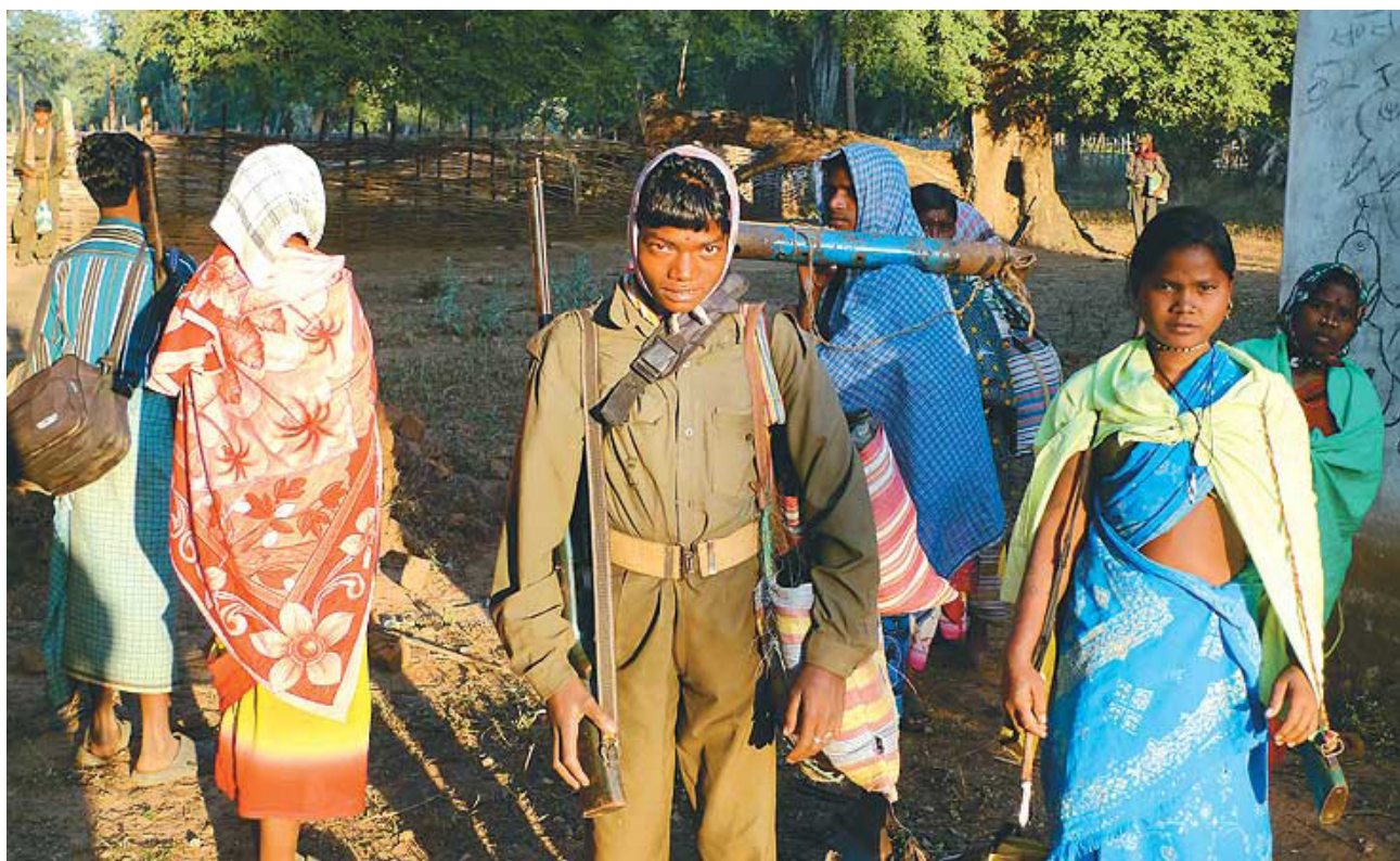
A village militia, the “base force” of the People’s Liberation Guerilla Army.