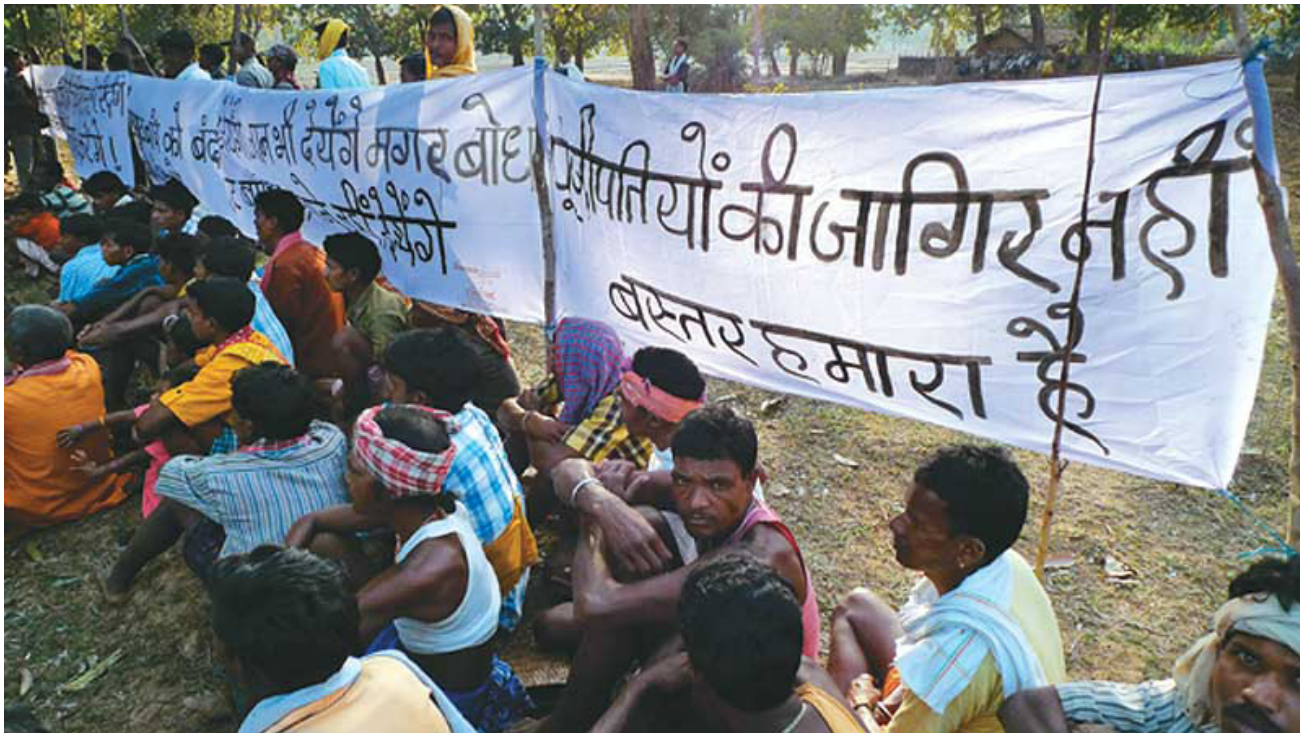
People of Kudur village protest the Bodhghat dam: "It does not belong to the capitalists, Bastar is OURS."

The most recent expression of concern has come from the Home Minister P. Chidambaram who says he doesn't want tribal people living in 'museum cultures'. The well-being of tribal people didn't seem to be such