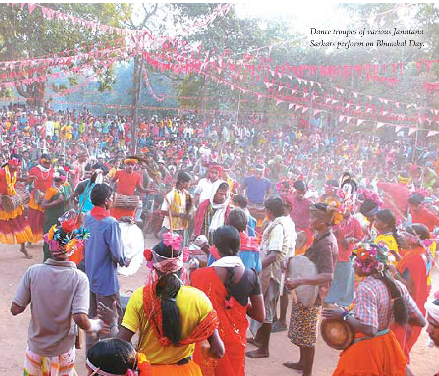
Dance troupes of various Janatana Sarkars perform on Bhumkal Day.