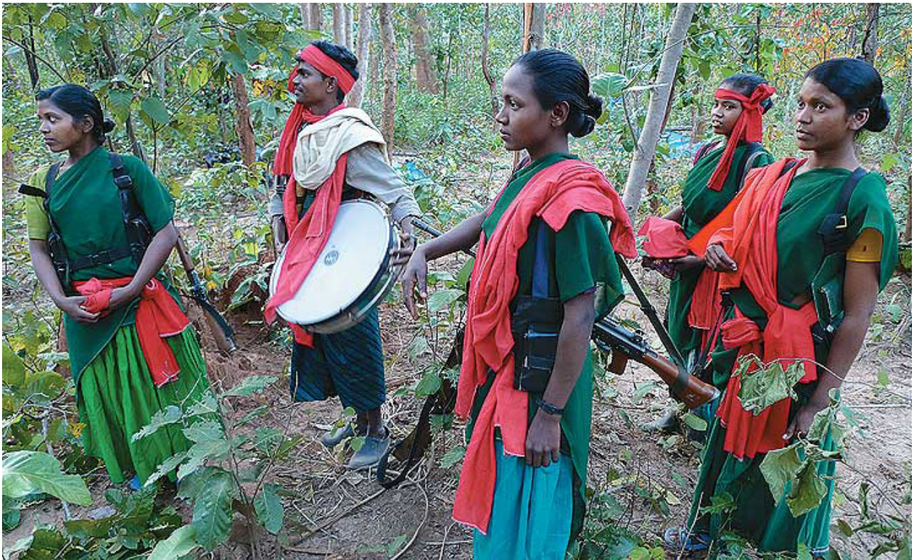
Members of the Chetna Natya Manch, the cultural wing of the party.

Then good news arrives. A small contingent of people with a plump young man. He's in fatigues too, but they look brand new. Everybody admires them and