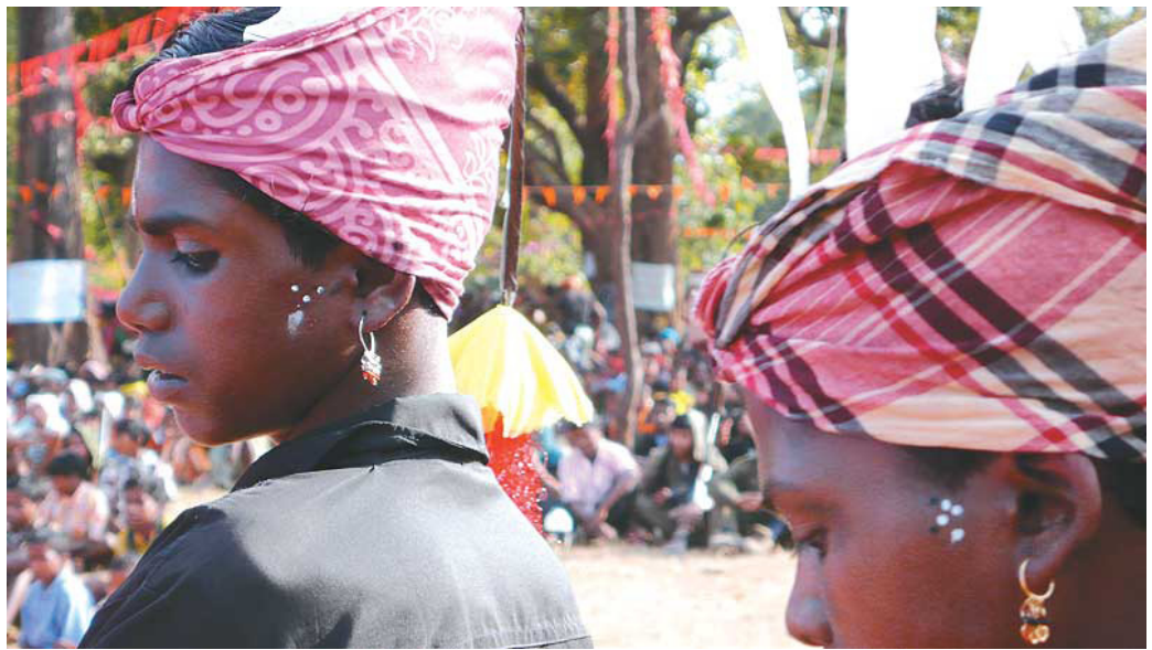
Adivasi boys in colourful traditional garb for Bhumkal Day celebrations.

It's never taken lightly, the ceremony of arrival and