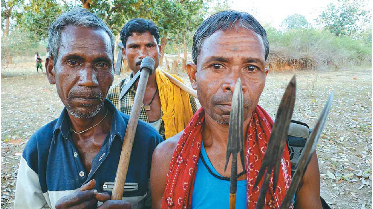
Villagers from the submergence areas of the proposed Bodhghat dam.

Bhumkal day, I can't help thinking that his analysis, so vital to the structure of this revolution, is so removed from its emotion and texture. When he said that only 'an annihilation campaign' could produce "the new man who will defy death and be free from all thought of self-interest"— could he have imagined that this ancient people, dancing into the night, would be the ones on whose shoulders his dreams would come to rest?