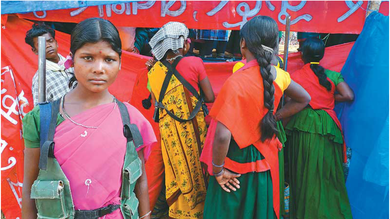
On the Day of the Bhumkal: Face to face with “India’s greatest Security Threat.”

pride in training street dogs to fight ‘terrorists.’ Eight hundred policemen graduate from the Warfare Training School every six weeks. Twenty similar schools are being planned all over India. The police force is gradually being turned into an army. (In Kashmir it’s the other way around. The army is being turned into a bloated, administrative, police force.) Upside down. Inside out. Either way, the Enemy is the People.