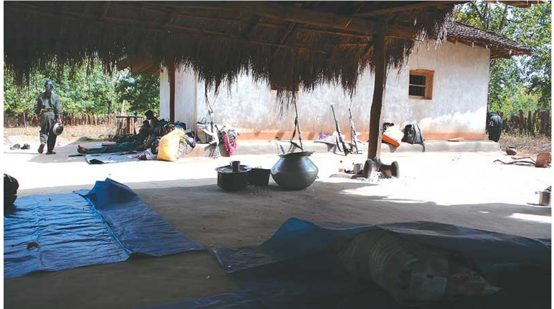
Pots, rifles, jhillies... Everything in these villages is clean and necessary.