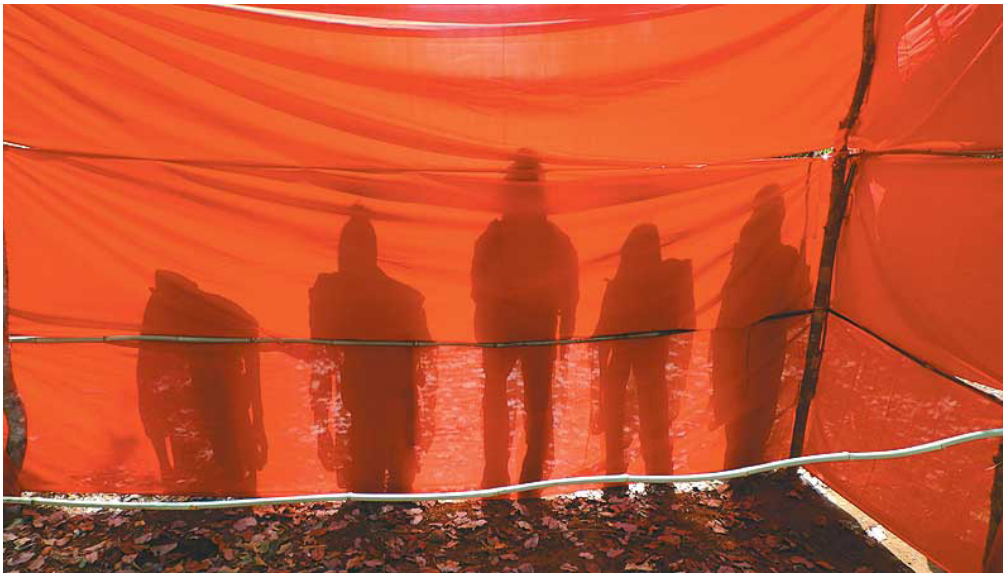
Centenary celebrations of the adivasi uprising in Bastar.

In Dantewara the police wear plain clothes and the rebels wear uniforms. The jail-superintendent is in jail. The prisoners are free (three hundred of them escaped from the old town jail two years ago). Women who have been raped are in police custody. The rapists give speeches in the bazaar.