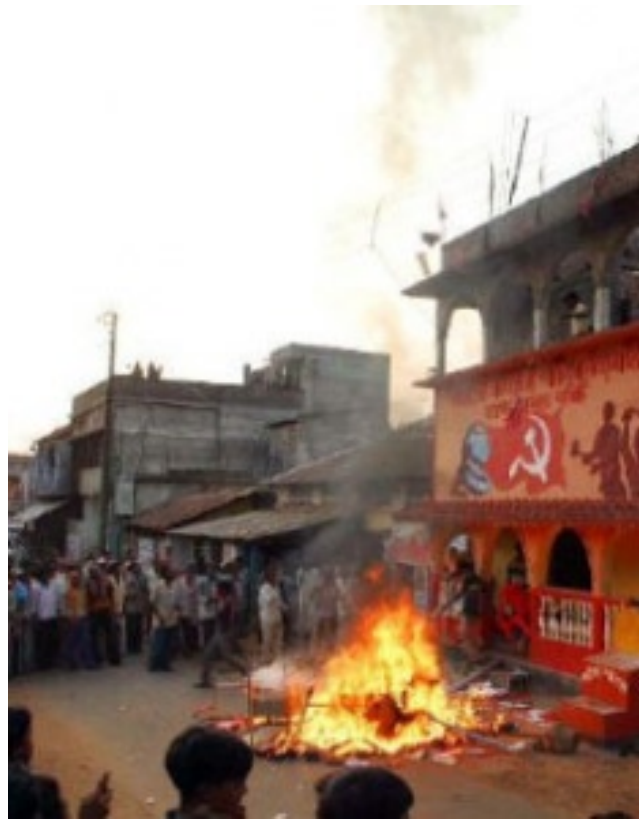
The people destroying a CPI-(M) party office

An important feature of the uprising has been the oppressive role played by the Communist Party of India (Marxist), known as the CPM—the dominant party in West Bengal’s Left Front government. This “communist” party has been deeply involved with West Bengal’s capitalists for decades and has brutally exploited West Bengal’s large tribal population. In the Lalgarh area, CPM leaders routinely pocket develop-