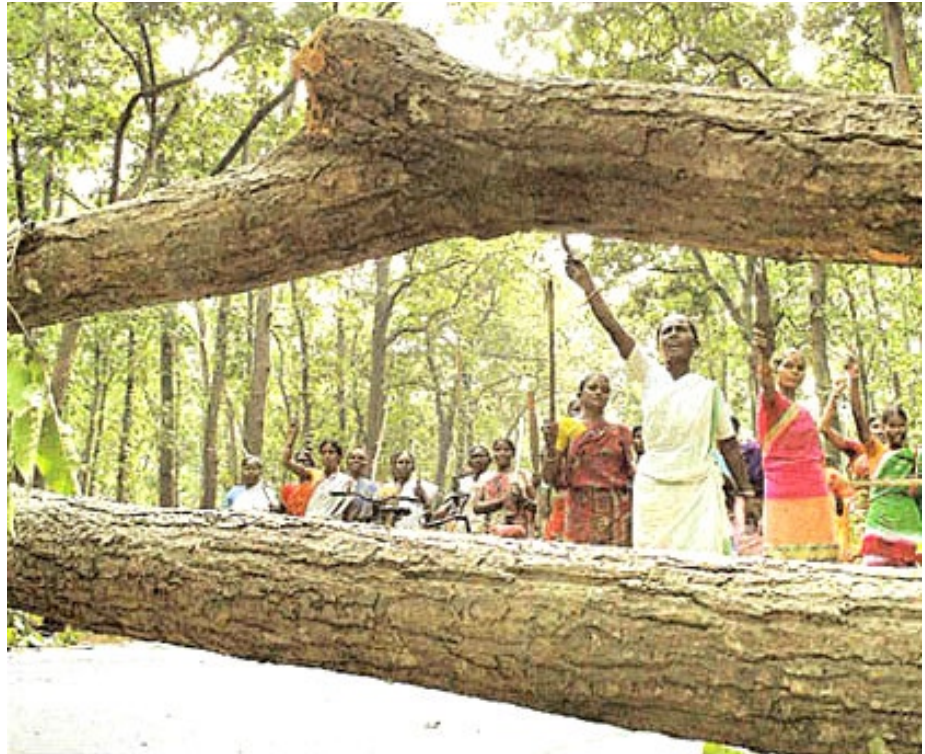
Rebel women at a roadblock

From the beginning the Lalgarh uprising has been a progressive force. Since its birth, this movement has had an undeniably organic character, and at its height, drew tens of thousands of villagers out to fight against the corrupt establishment. The movement, clearly born out of the struggles of the noble adivasi peasants, has transcended rural tribal lines in important ways by drawing solidarity and defense from broader sections of the populace including students, 26 human rights organizations, 27 small store owners, and adivasi migrant workers. 28