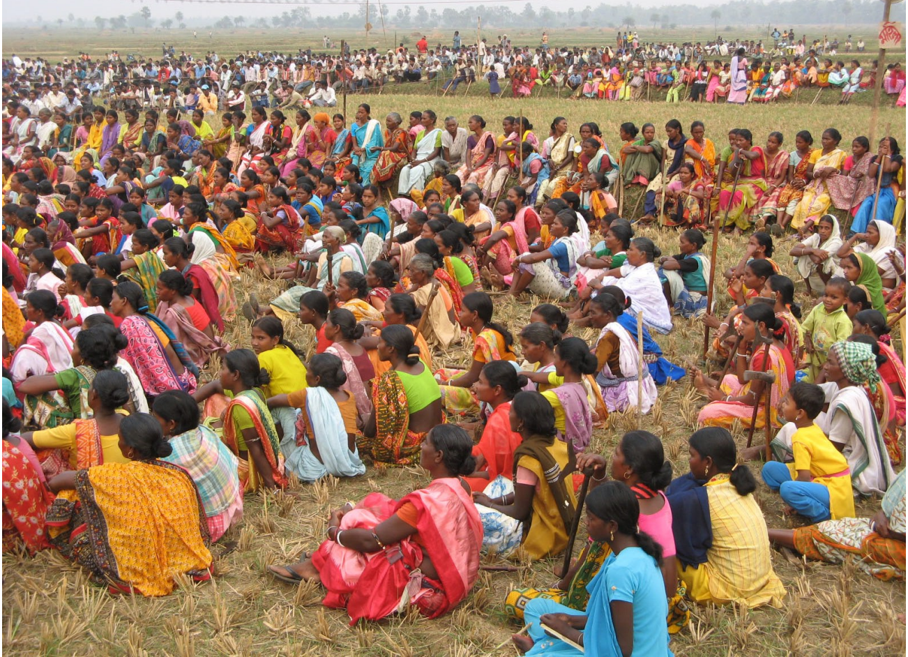
Women at an assembly in Lalgarh

Huge mobilizations of this nature went on without pause for more than a month, drawing widespread attention. Police officers became subject to a social boycott, making it difficult for them to acquire the basic necessities of food and sanitary items required to stay in the area. Coupled with a strong Maoist presence, the social boycott made the Lalgarh area almost impassable for governmental authority figures. 7 Since these events, the uprising has spread like a wildfire influencing hundreds of villages in the West Midnapore district and has drawn immense support not just in West Bengal, but also from many areas in India. It has assumed a definite political character.