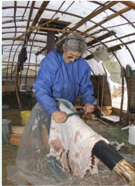
A member of the Mistissini Cree prepares a skin

The park has been a long time in coming. In 1948, the government created a wildlife reserve that incorporated lakes Albanel, Mistassini, and Waconichi. Under this designation, hunting and fishing have been allowed in the reserve. Interest in creating a park began in the 1970s, even before the James Bay and Northern Québec agreement