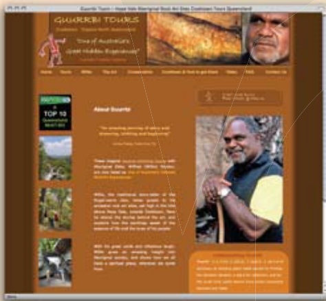
Winner of the judged 2009 ITBW Award Guurri Tours (Australia) www.guurrbitours.com