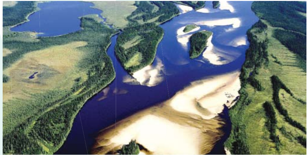
The Témiscamie River in Québec, Canada