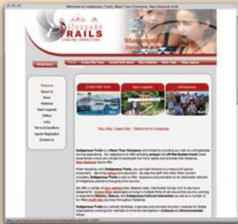
Winner of the popular count 2009 ITBW Award Indigenous Trails (New Zealand) www.itrails.co.nz

For complete results and list of nominees www.planeta.com/planeta/09/0903itbw.html www.cbd.int/tourism/Award.shtml.