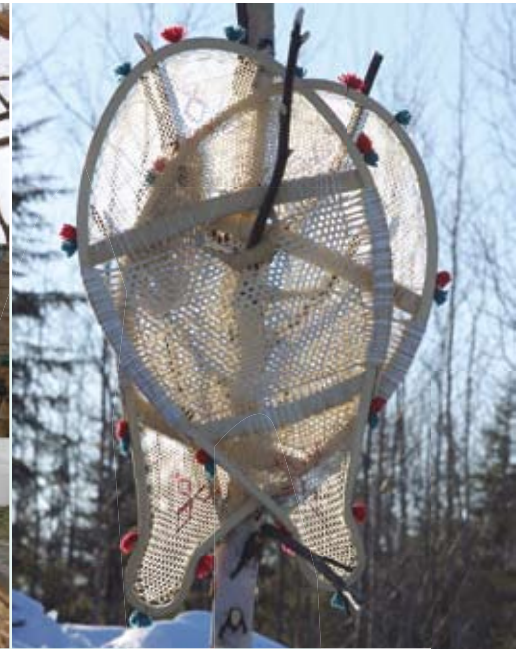
Mistissini Cree snowshoes