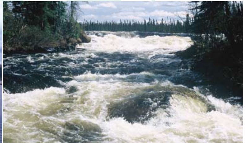
Rapids in the Rupert River