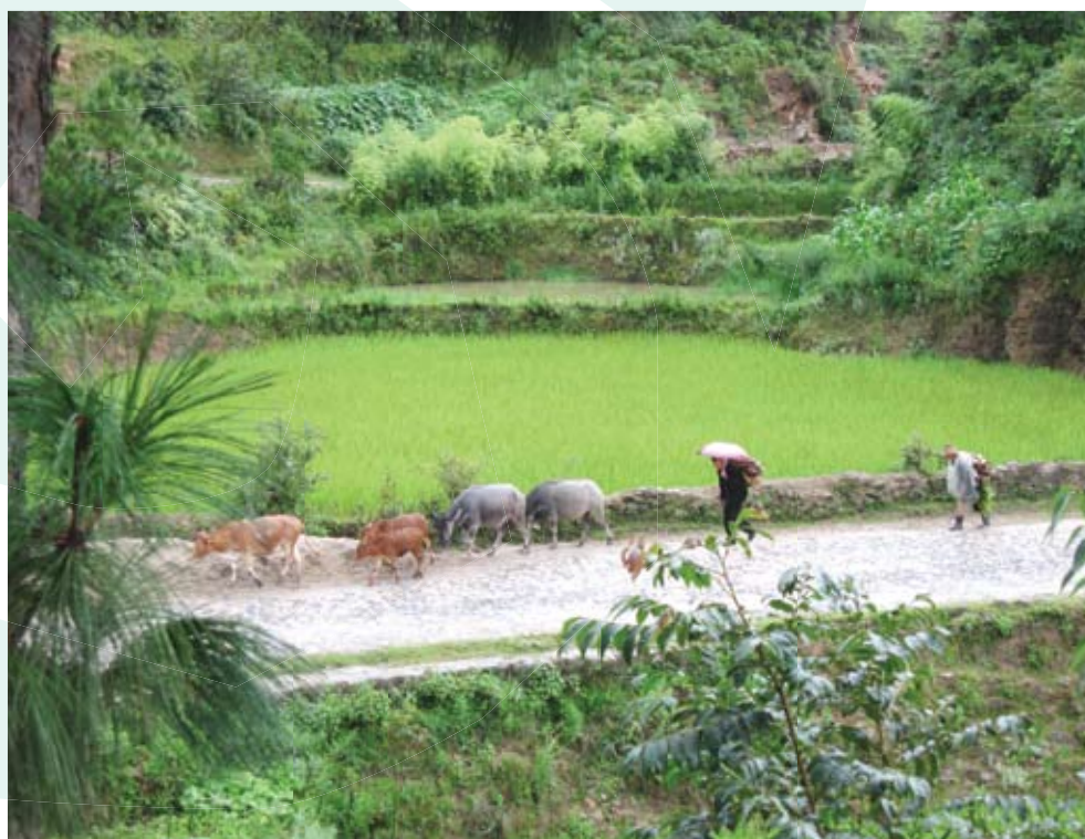
Terraced fields and local farmers in Yunnan, China

Additionally, in early 2007, the Beijing High People's Court heard the first case that dealt with how patent law protects traditional medicine in China. In this case, the Tianjin Tasly Group had patented a Nourishing Blood and Cleaning Brain Granule that helps to moderate headaches that are brought on by hypertension and liver problems. The