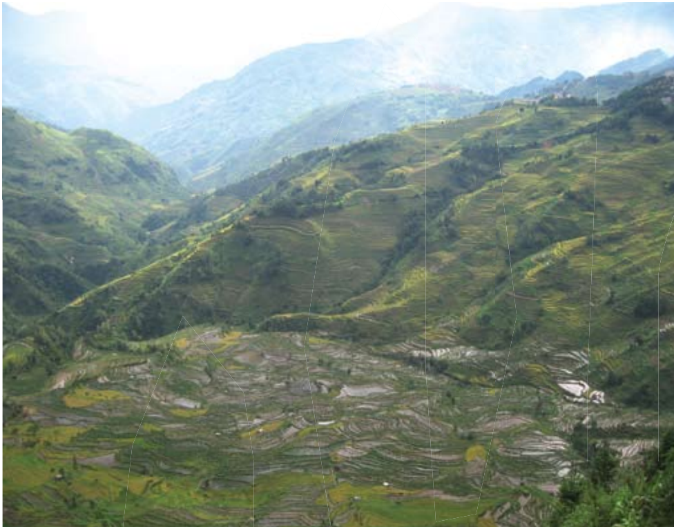
Farming in terraced fields has been practiced for many years by minorities living in mountain areas of Yunnan Province, China.

medicine received not only a patent but also administrative recognition as a special medicine. After discovering that the Dongguan Group had been manufacturing the same drug, Tianjin Tasly sued Dongguan for patent infringement. The court relied on expert testimony from the Beijing University of Chinese Medicine who determined that the essential recipe used by Dongguan was basically the same as Tianjin Tasly.