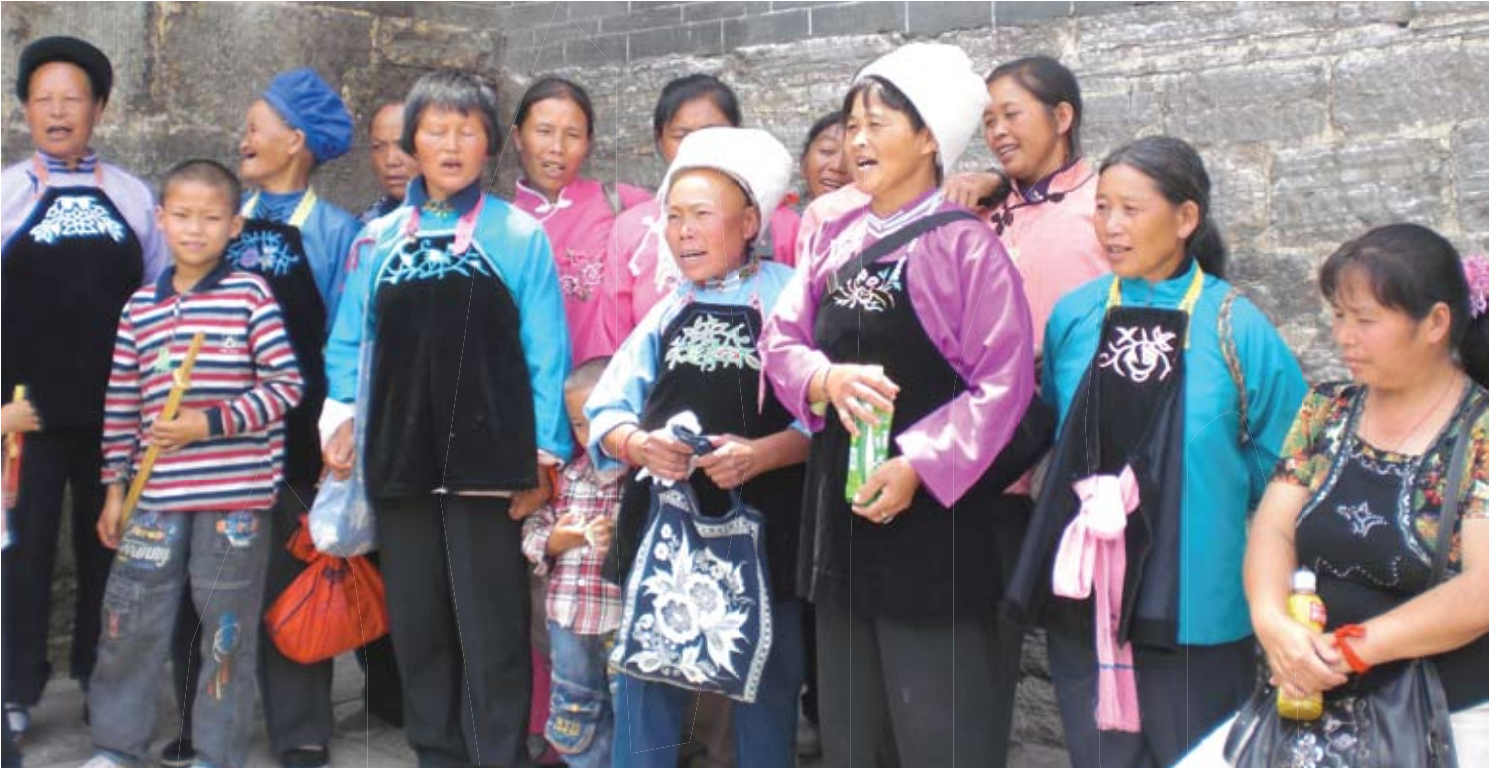
Minorities from Yunnan Province in China