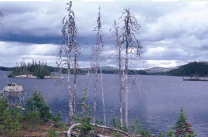
Lake Bellinger, Québec

But for the Cree who will see their lands and waters protected for the enjoyment of their children and grandchildren, as well as for the tourists who will learn about the land and its stewardship from the Cree, the long process and tremendous energy invested in creating the park in partnership with the Government of Québec will be well worthwhile. □