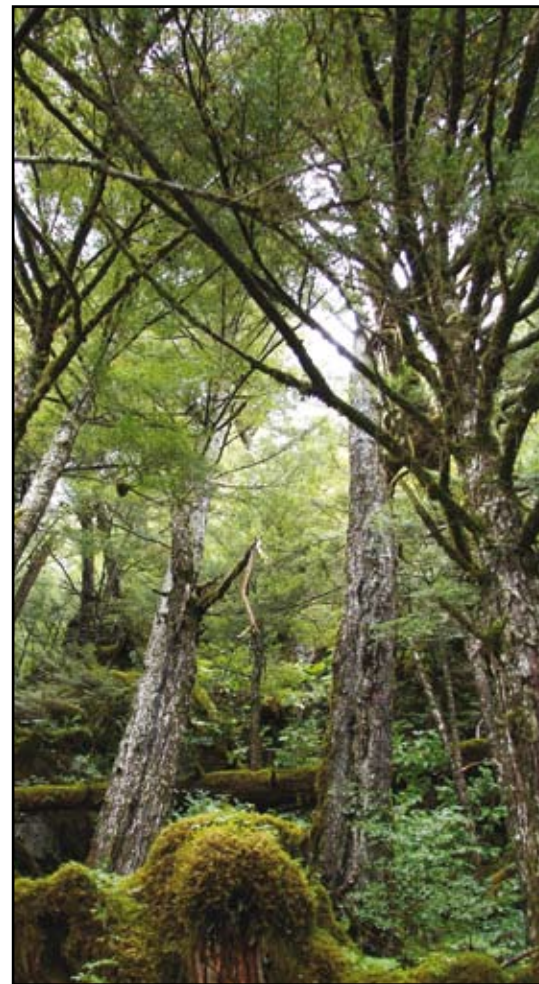
Tropical forest.