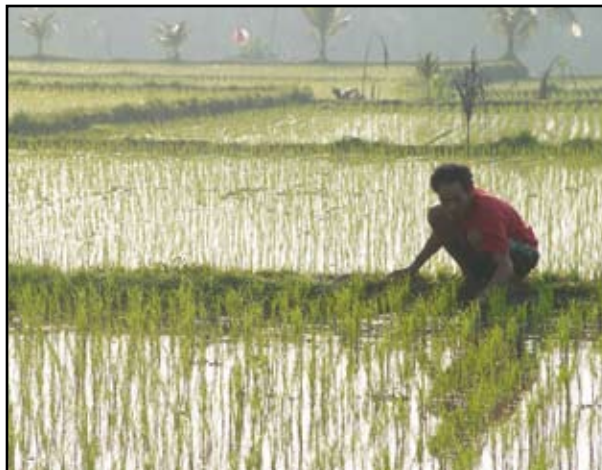
Rice paddies, Bali, Indonesia. Rice first originated in Asia but is now grown all around the world.

To meet an increasing demand for a steady supply of uniform food products, many local varieties have been replaced by improved exotic varieties and species, which further erodes genetic agrobiodiversity. Since agriculture began 12,000 years ago, humans have cultivated and collected 7,000 plant species. Today, 90% of our food comes from only 15 plant species and eight animal species! The shift away from locally diverse food production systems threatens their continued existence and, with them, the accompanying local and traditional knowledge, associated cultures and skills of the food producers.