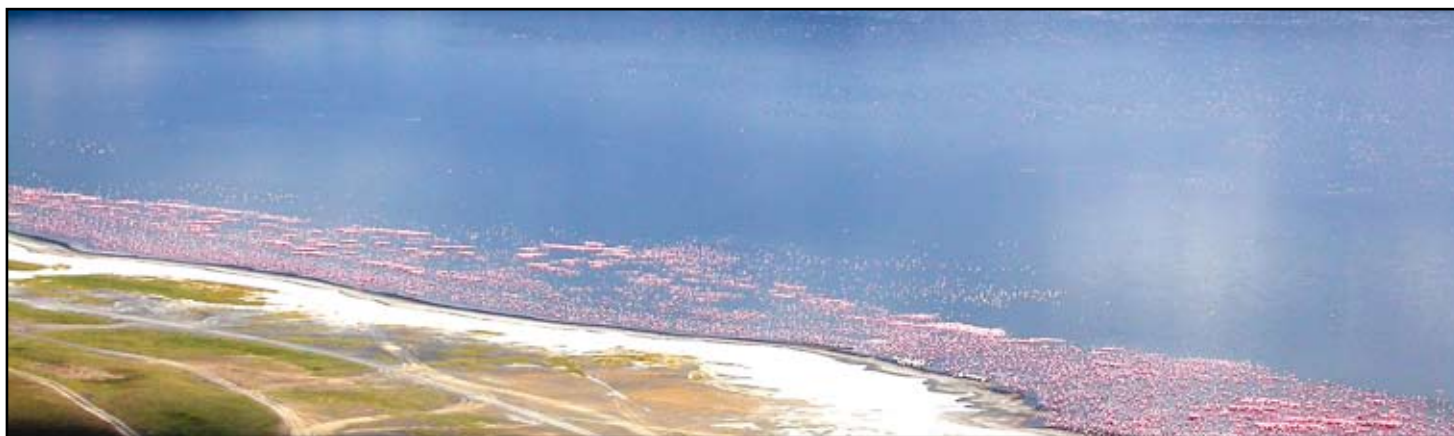
Flamingos in Lake Nakuru, Kenya.

Cada año, el CDB crea una colección para grupos informativa y divertida para celebrar el Día Internacional de la Diversidad Biológica. Si a tu escuela le gustaría recibir la colección de 2008, por favor envíe tu solicitud a christine.gibb@cdb.int o al Convenio sobre la Diversidad Biológica, c/o Christine Gibb, 413 Rue St. Jacques O, Suite 800, Montreal Québec, H2Y 1N9, Canadá. Las colecciones se incluirán dentro de nuestra página Internet a partir de abril de 2008, y serán enviadas al mismo tiempo. Asegúrate de incluir el nombre y dirección de tu escuela y de la persona responsable.