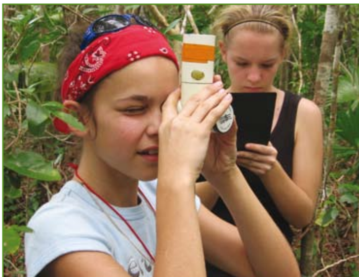
Student participants collect data as part of their ecological studies.

Students attending the "Youth Symposium on Biodiversity" submitted project abstracts regarding the conservation work they are doing at their home sites. All worthy projects were accepted and funding was found for all to attend.