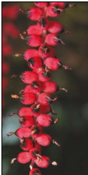
Aechmea.