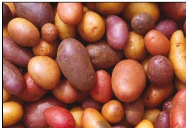
There are more than 250 species of wild potatoes around the world.

This Kenyan farmer uses a "zero grazing technique," in which he grows fodder and brings it to his cattle. This technique gives him more control over the productivity of the livestock and allows him to recycle more waste.