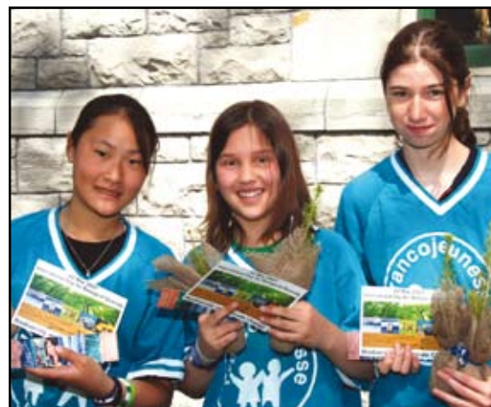
Students from Francojeunesse in Ottawa, Canada participate in a tree planting event to celebrate IBD and UNEP's Billion Tree Campaign.