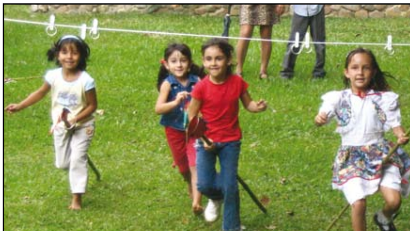
Costa Rican children celebrate at a village Biodiversity Centre.

In the first edition of Gincaniño , I called upon you, the children and youth, to adopt the spirit of the 2002 Youth Declaration. It is imperative for you, as the leaders of tomorrow, to become engaged in the international biodiversity agenda and to work to protect all life on Earth. You have responded enthusiastically to the challenge, and we at the Secretariat are delighted to support your initiatives.