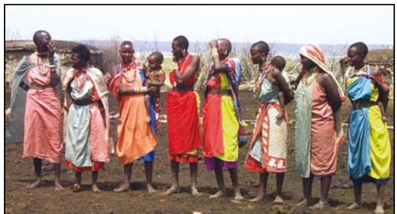
Masai women.