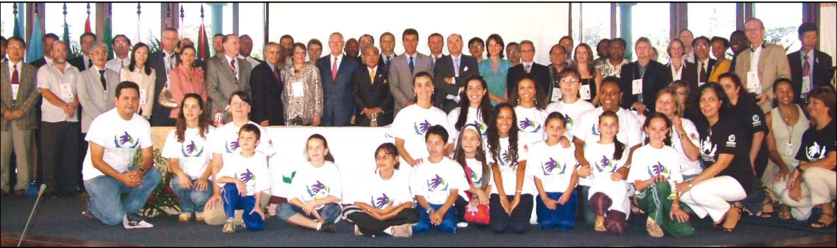
Children and youth of Curitiba sitting with delegates at the “Cities and Biodiversity: Achieving the 2010 Biodiversity Target” in Curitiba, Brazil.