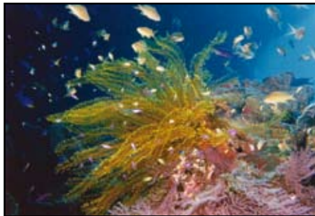
Coral reefs are sometimes called the 'tropical rainforests of the ocean' because of the biodiversity they house.

Reef Initiative (ICRI), a partnership among governments, international organizations (including the CBD), and non-governmental organizations throughout the world, has designated 2008 as the International Year of the Reef (IYOR 2008).