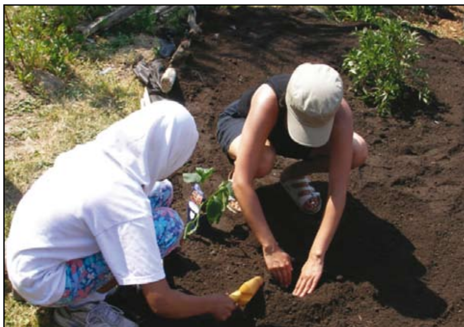
Canadian students begin a school garden project.

For more information please go to: www.lsf-lst.ca or www.ecoleague.ca .