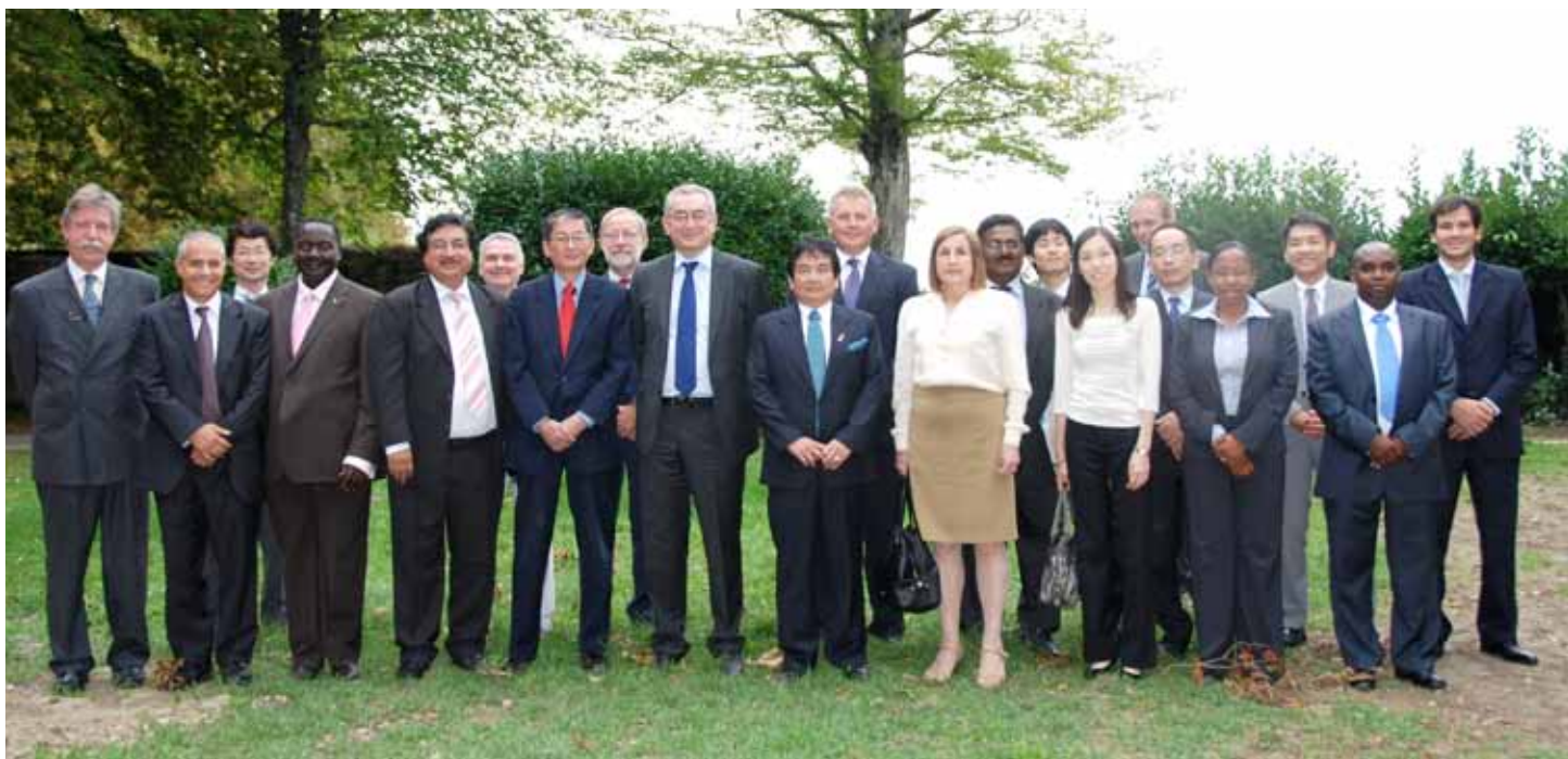
Past, Present and Future Presidencies