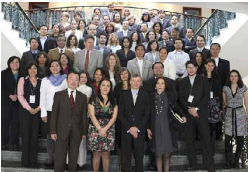
Participants of the workshop

Días antes de este taller, la Organización del Tratado de Cooperación Amazónica (OTCA), realizó un taller para los países amazónicos con el objetivo de promover el diálogo en temas de conservación, protección y uso sustentable de los recursos naturales renovables. En este taller se revisó la Agenda Estratégica de Cooperación Amazónica, especialmente el eje de Conservación, Protección y aprovechamiento Sostenible/Sustentable de los Recursos Naturales Renovables en sus temas de Gestión, monitoreo y control de especies de fauna y flora silvestres amenazadas por el comercio; Áreas Protegidas; Uso sostenible de la biodiversidad y promoción del biocomercio.