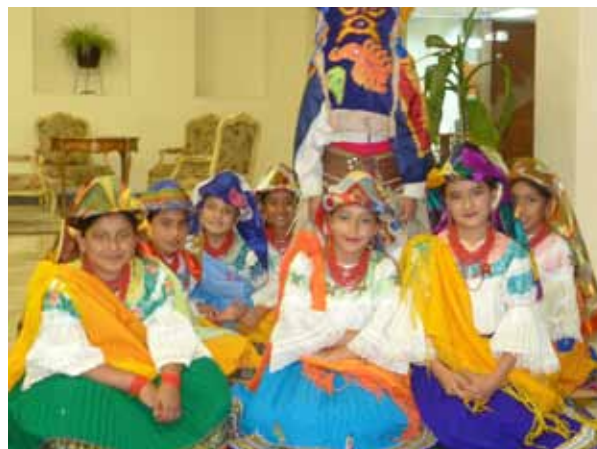
UNDB launch celebration

destacando la participación del Señor Embajador de Japón quien en representación de su país y principal contribuyente para la implementación del Plan Estratégico 2011–2020 y sus Metas Aichi, agradeció al gobierno del Ecuador por la organización del evento, reiterando una vez más su compromiso de apoyo a pesar de la situación que el pueblo de Japón ha sufrido por el último desastre natural. ❖