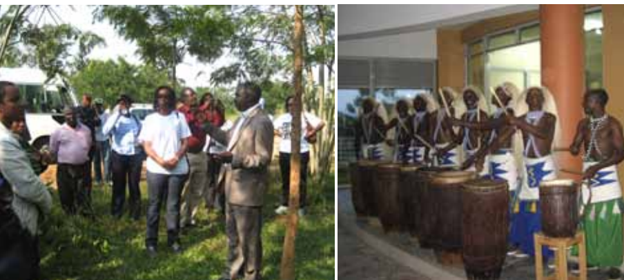
Field trip visit and official reception