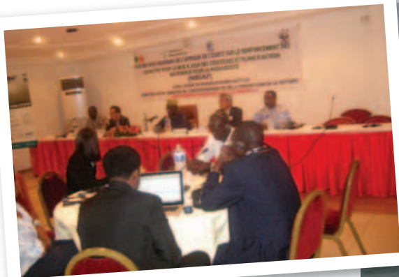
ABOVE: Opening ceremony RIGHT: Field study visit

« Une marque de reconnaissance et un encouragement des efforts de notre pays en matière de conservation de la biodiversité, mais surtout la volonté du Gouvernement du Sénégal de participer pleinement à la mise en œuvre de la Convention sur la Diversité biologique ». —Mr. Djibo Leity Ka, Senegal Minister of Environment and Protection of Nature