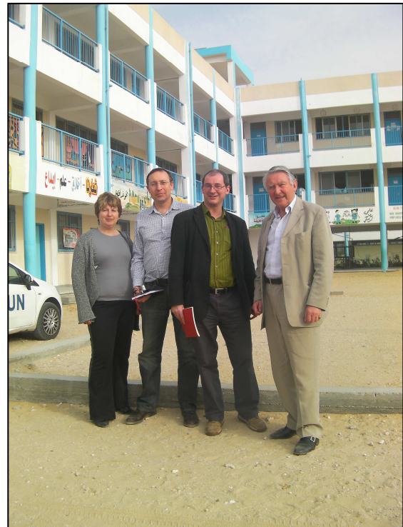
Delegation L-R: Karen Buck MP, Andy Slaughter MP, Stephen Williams MP & Rt Hon Lord Steel

In addition to their programme with UNRWA, the delegates also held a number of political meetings, with both the Hamas Justice Minister Faraj al-Goul and Deputy Foreign Minister Dr Ahmed Yousef, as well as with Fatah Members of Parliament.