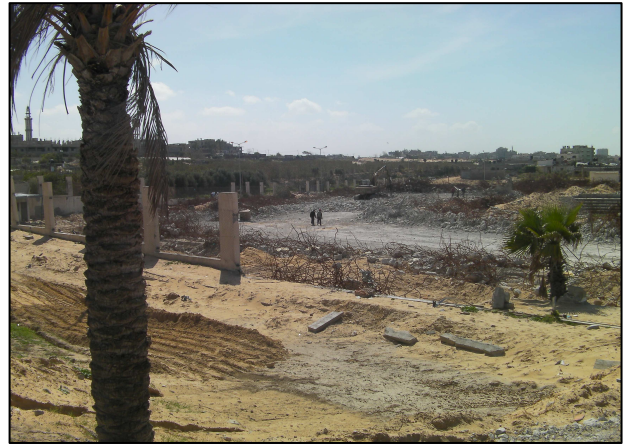
American International School, March 2010

The report demanded that both sides conduct appropriate investigations into the events of the conflict. However, the only investigations launched have so far proved insufficient.