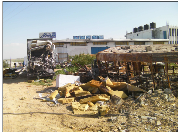
Al Meer Factory, February 2009

The Agreement on Movement and Access (AMA), signed by Israel, Egypt and the Palestinian Authority, stipulates that 15,500 trucks per month should be allowed to enter Gaza via the crossing points with Israel. However, since June 2007 the total number of trucks entering the territory has been only a fraction of this, typically representing around 20% of previous levels. In January 2010 for example, 2,062 trucks entered Gaza, down slightly on the 2,597 that entered in December 2009. ii