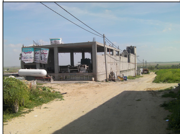
Al Meer Factory, March 2010

Exports have also ground to a halt. Israel allowed the limited transfer out of Gaza of cut flowers in February, but this represented the first significant export since April 2009. iii This has destroyed the private sector in the Gaza Strip, with 95% of businesses closing down since the start of the siege.