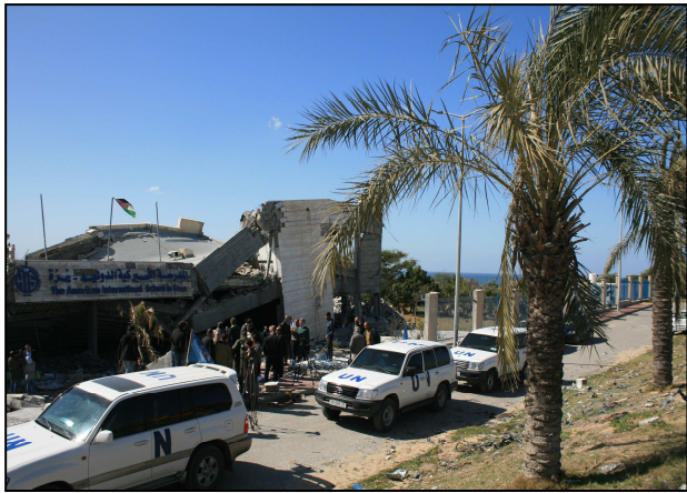
American International School, February 2009