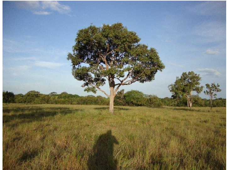
Saladillo rojo ( Caraipa llanorum ) in natural reserve.