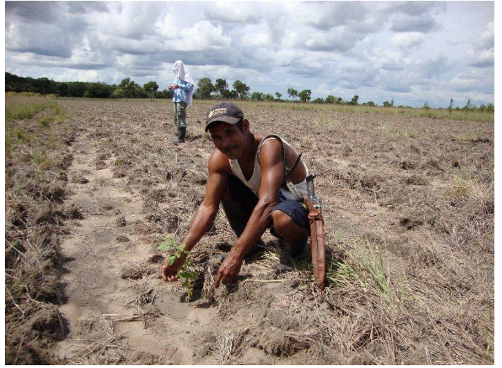
Congrio plantation before inundation starts.