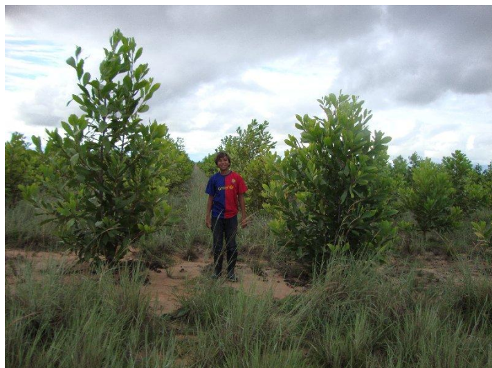
Dagan in 10 month Acacia mangium plantation in sand.