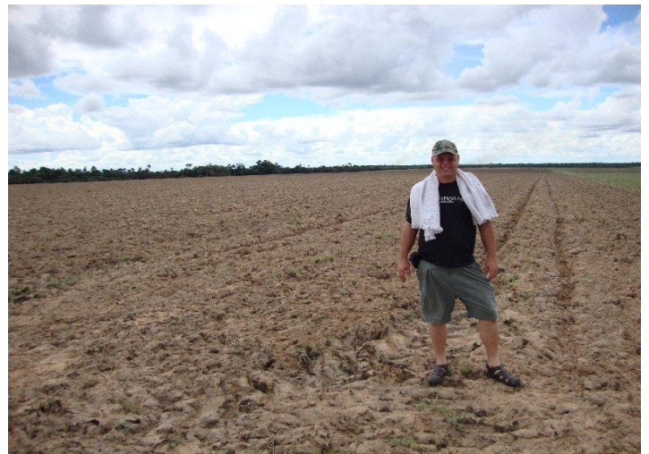
Field ready to be planted after ploughing in June 2010.