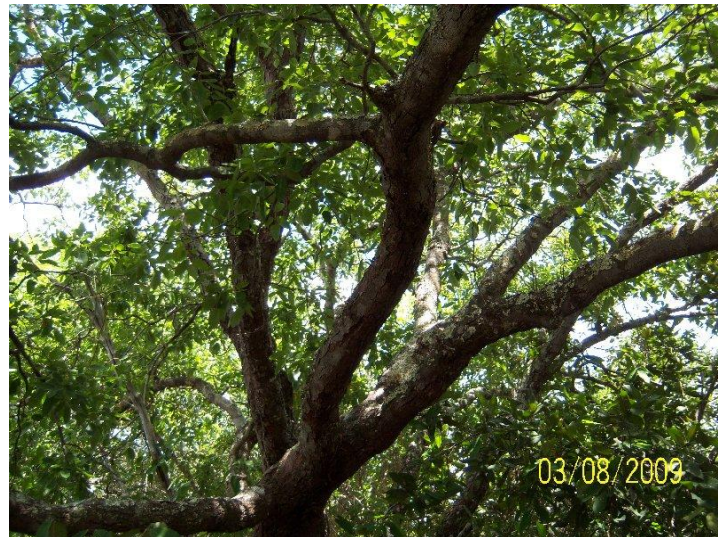
Mature Congrio ( Acosmium nitens ) in natural reserve.