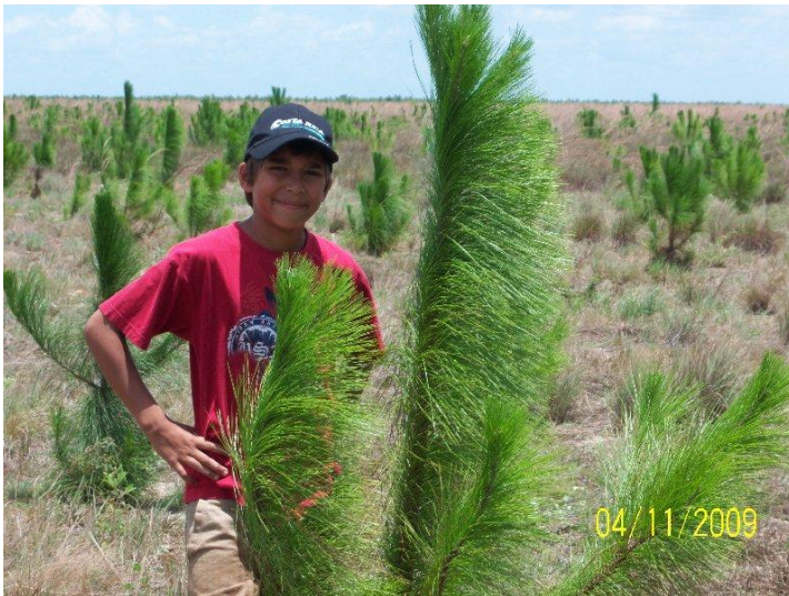
Dagan in 8 month Pino caribe ( Pinus caribaea ) plantation.