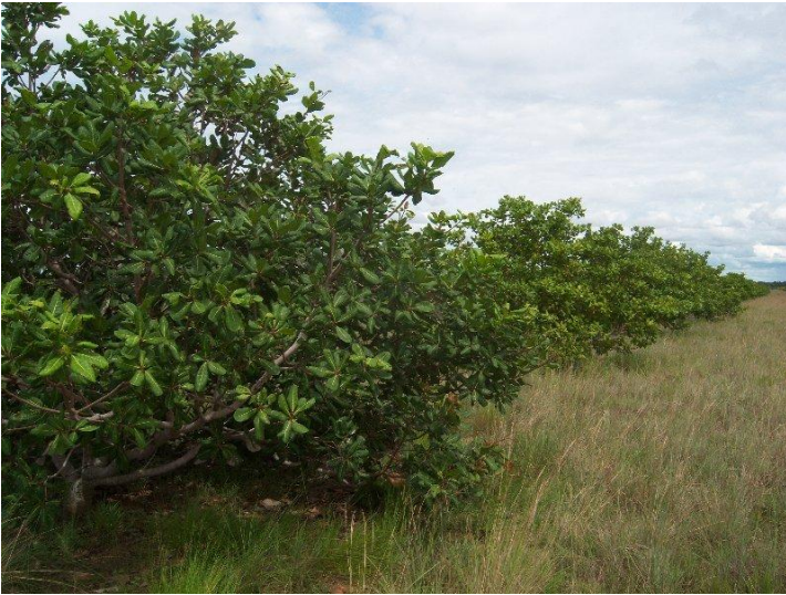
3 year cashew ( Marañon ) plantation.