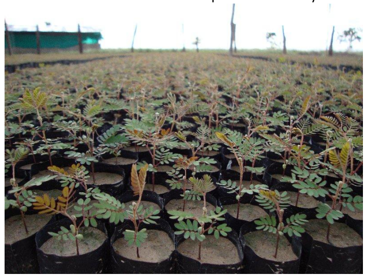
Acacia mangium seedlings waiting to be planted 2010.