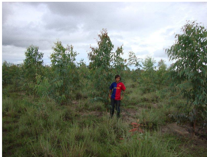
10 month old Eucalyptus pellita plantation in gravel.