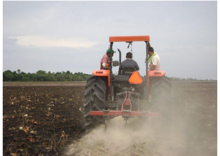
Preparing soil to 75 cm depth after fire control.