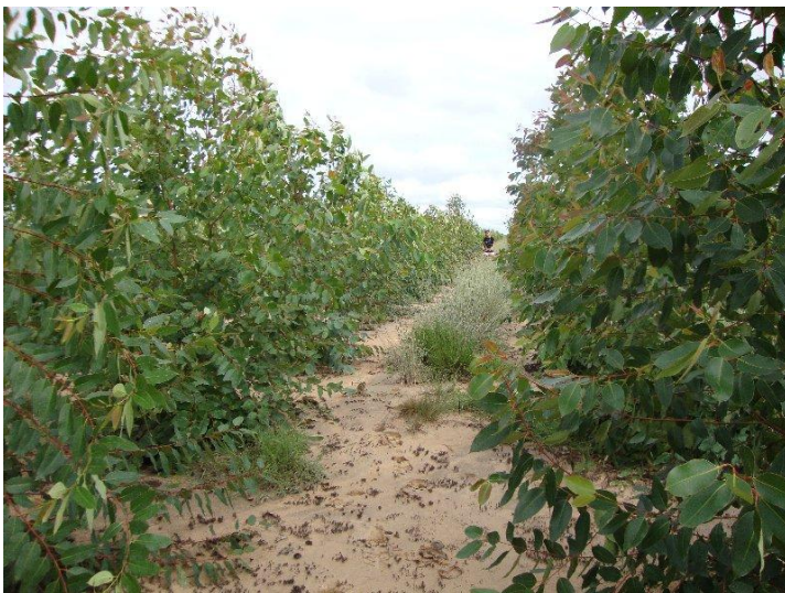
10 month Eucalyptus pellita plantation in sand.