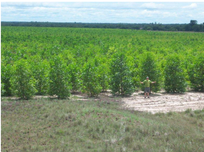
11 month Acacia mangium plantation as far as eye can see.