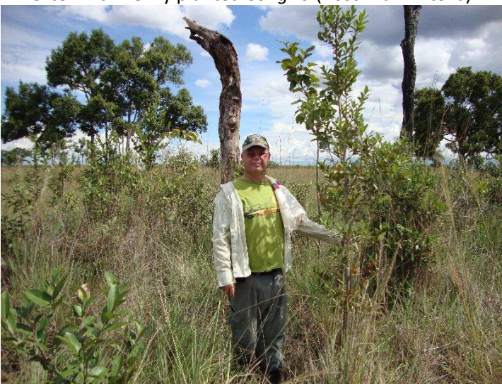
Dexter in Saladillo rojo planted inundation area.