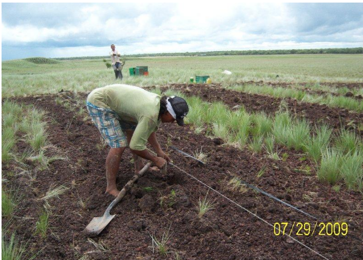
Trees being planted in ferrous-oxide gravel.