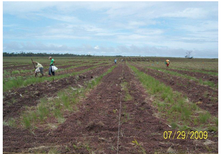
String marks straight line for planting.