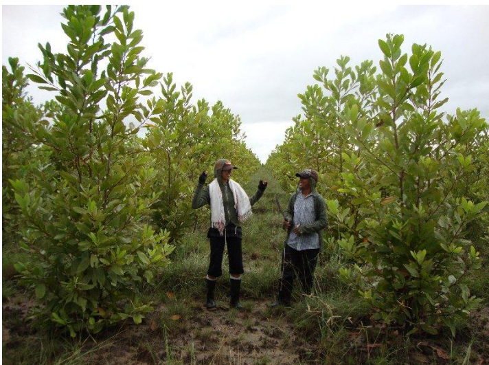
10 month Acacia mangium plantation in gravel.