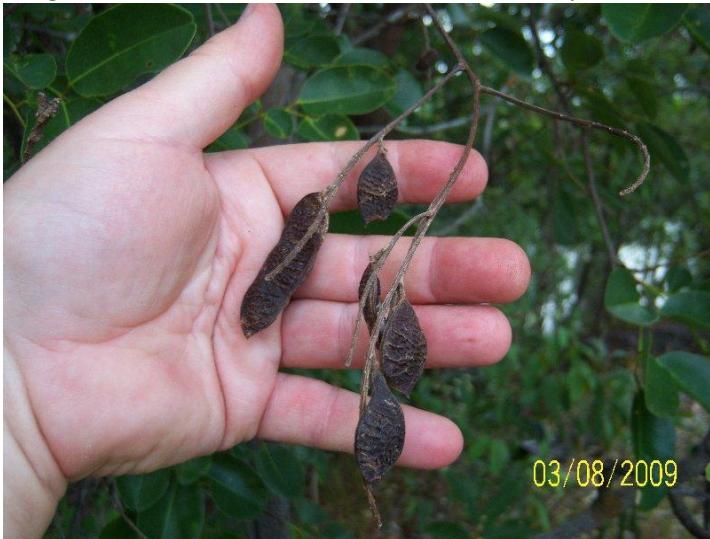
Collecting Congrio seeds in natural reserve.