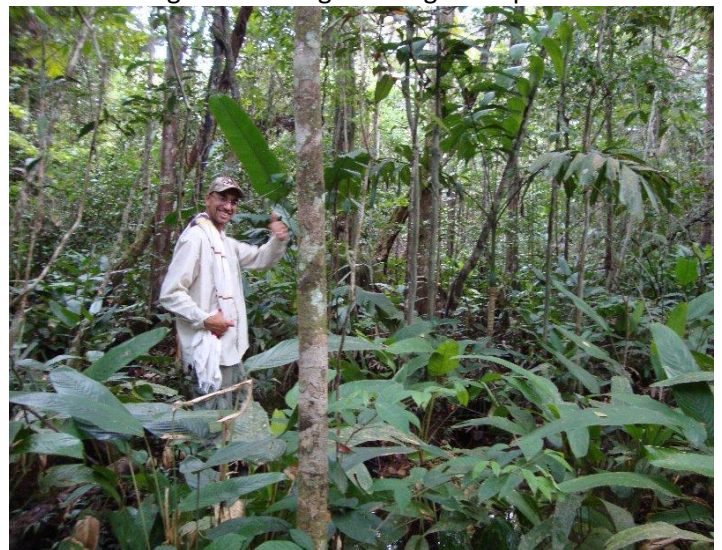
Dilmun enjoying biodiversity in natural reserve 2010.