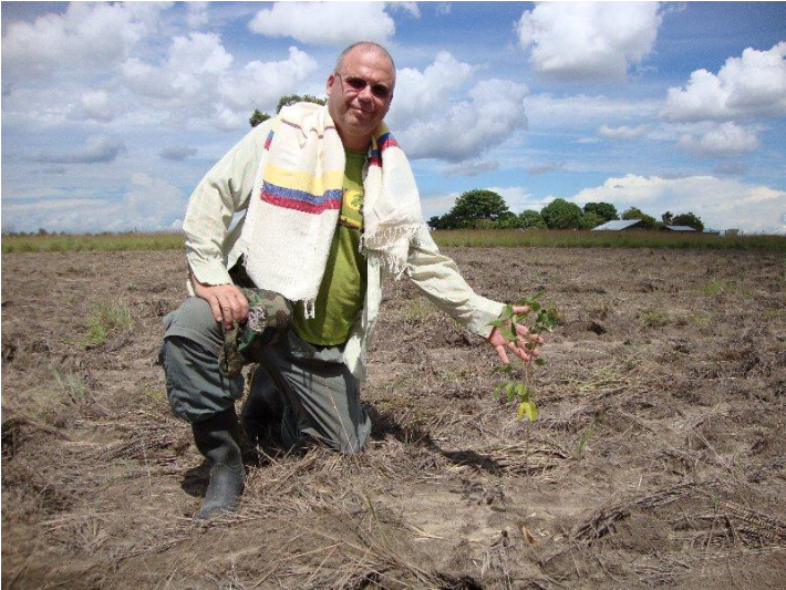
Dexter with newly planted Congrio ( Acosmium nitens ).