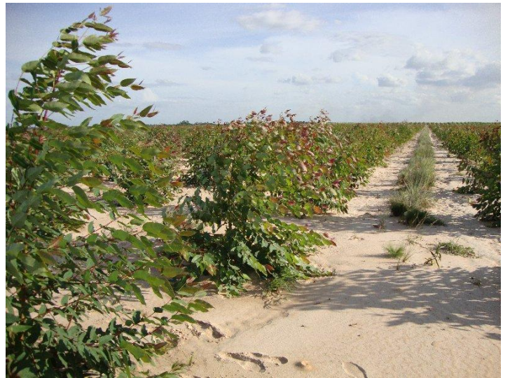
6 month old Eucalyptus pellita plantation.