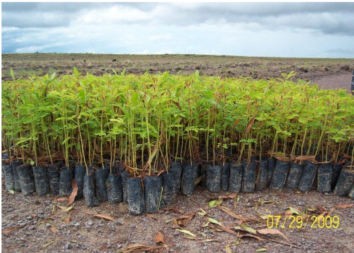
Acacia mangium seedlings waiting to be planted.