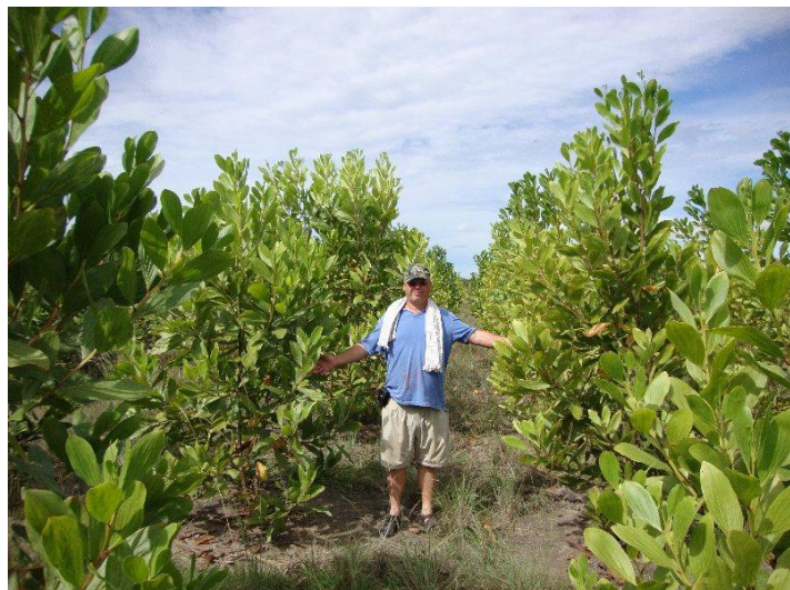
Dexter in 11 month Acacia mangium plantation.