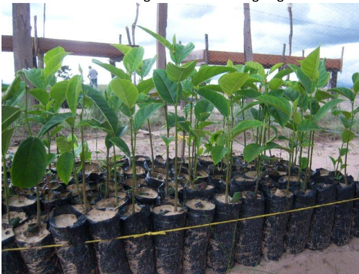
Jackfruit ( Artocarpus heterophyllus ) seedlings 2010.