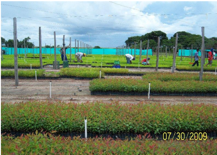
Workers in tropical tree nursery.