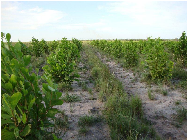
6 month old Acacia mangium plantation.