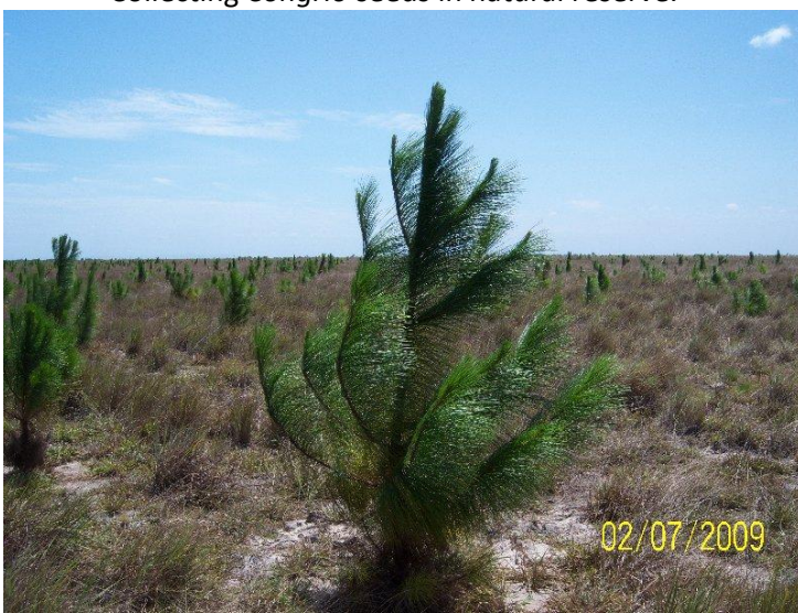
6 month old Pino caribe .