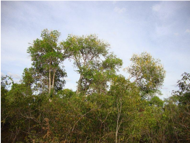
Saldillo blanco ( Vochysia obscura ) in natural reserve.