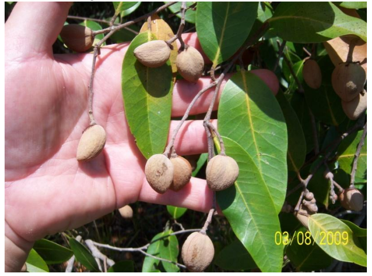
Collecting Saladillo rojo seeds in natural reserve.