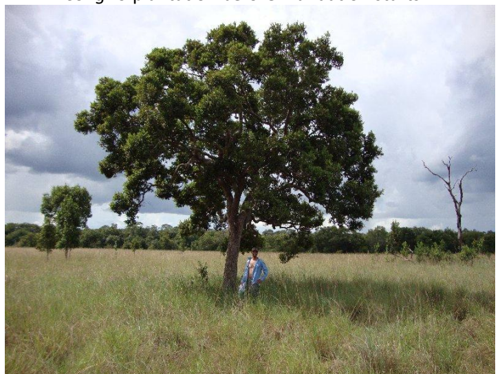
6 year old Saladillo rojo ( Caraipa llanorum ).