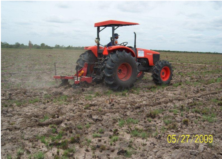
Preparing soil to 75 cm depth with 105 HP Kubota.