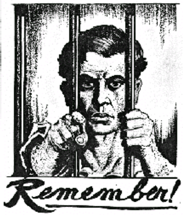
WE ARE IN HERE FOR YCC, YOU ARE OUT THERE FOR US

The General Defense Committee of the IWW was first formed in 1917 to provide defense support for IWW members who found themselves battling the "forces of law and order" who sought to prosecute them for no other crime than what they believed !