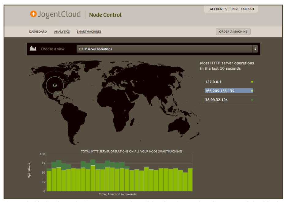
Joyent's Node Control offers a comprehensible visual overview for users of the No.de service.

Analytics in the cloud are usually complicated and clunky. Troubleshooting for both the service provider and client is time consuming and difficult due to the incredibly fluid nature of cloud environments and the higher degrees of application complexity in