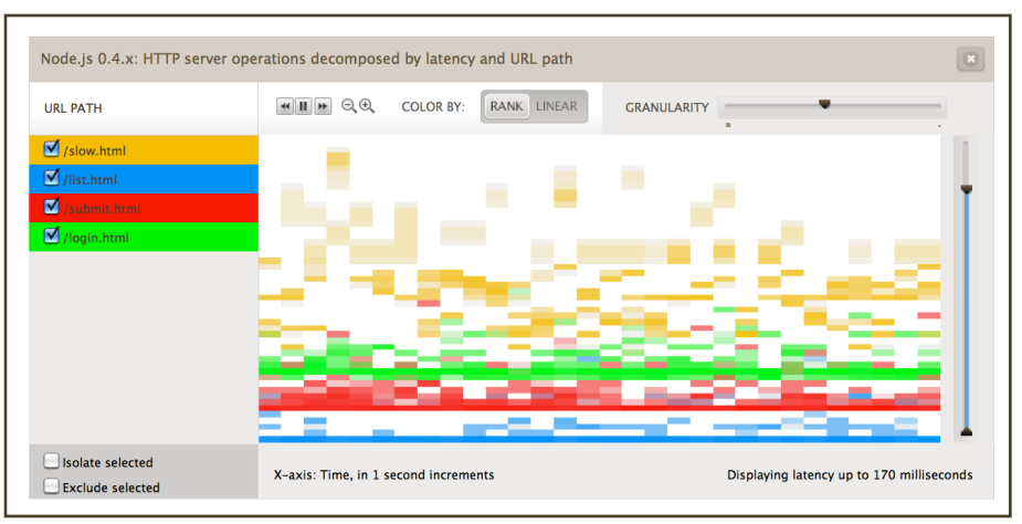
Heatmap visualizations like this can make it easy to spot patterns and outliers for key performance metrics like latency.

virtualized environments. Joyent SmartDataCenter employs DTrace, an award-winning dynamic tracing framework, to enable Joyent Cloud Analytics to track more than 4,000 different parameters and activities up and down the Joyent SmartDataCenter software stack. This unprecedented visibility delivers equally unprecedented transparency without compromising simplicity or flexibility. Viewable parameters in Joyent Cloud Analytics include compute nodes, SmartMachine capacity and utilization, activity streams and requests – even down to latency performance for specific URLs or server calls. In addition, operators can use Joyent Cloud Analytics to manage Disk I/O, a useful mechanism for improving performance in a multi-tenant virtual data center that allows operator administrators to more easily isolate customers' processing tasks. Lastly, DTrace exerts no drag on performance so operators can perform full and continuous analytical queries in a production environment without worrying about increasing latency.