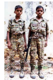
LTTE Child Soldiers

-The LTTE's use of children as front-line troops was proved when 25 front-line troops between the ages of 13 and 17 surrendered en masse to the Sri Lankan Forces. Amid international pressure, LTTE announced in July 2003 that it would stop conscripting child soldiers, but both UNICEF and Human Rights Watch have accused it of renegeing on its promises, and of conscripting Tamil children orphaned by the tsunami. Civilians have also complained that the LTTE is continuing to abduct children, including some in their early teens, for use as soldiers. Moreover UNICEF states that the LTTE has recruited 315 child soldiers between April and December 2006. According to UNICEF, the LTTE is known to be the world's worst perpetrator of child soldier recruitment and has recruited, since 2001, a total number of 5,794 child soldiers.