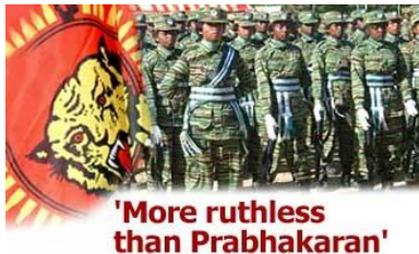
LTTE Women Soldiers

-The LTTE has a large number of female recruits. Female members are believed to make up between 20 to 30 percent of the LTTE's fighting cadre. An estimated 4000 women cadres have been killed since 1987, including over a hundred in 'Black Tiger' suicide squads. The assassination of Indian Prime Minister Rajeev Gandhi, the attempt on President Chandrika Kumaratunga and the 2006 attempt on the Sri Lanka