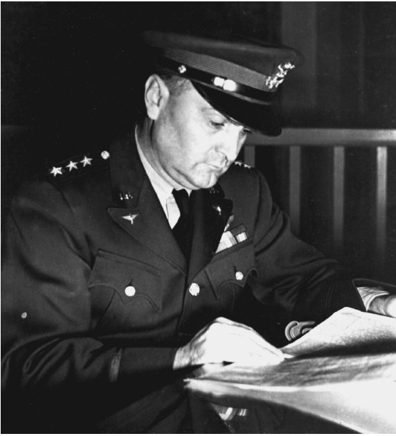
Advocates of continued daylight bombing included ( above ): Ira Eaker, and ( right ): Carl Spaatz (left) and Hap Arnold.