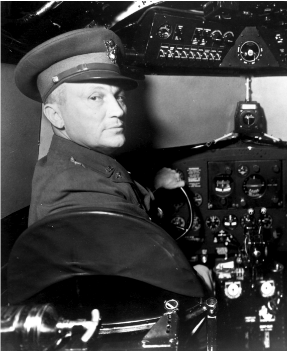
Lt. Gen. Frank Andrews in cockpit of B-17.

Andrews's previous activities offers insight into the forward reach of his thinking at a time when the military was economically and strategically constrained, locked into the rigidity of the status quo.