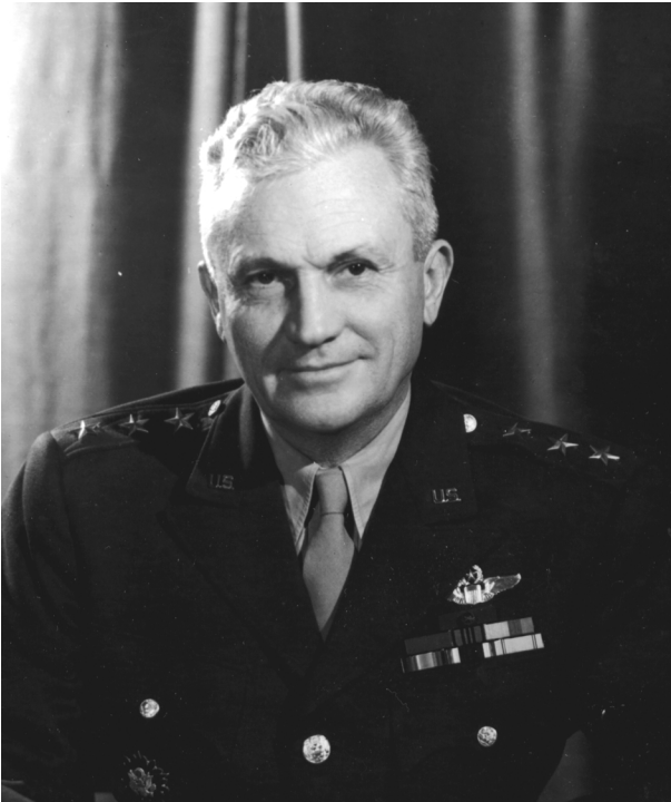
Lt. Gen. Frank M. Andrews

While he had served in the Caribbean for nearly two years, Andrews's command of USAFIME was extremely brief, lasting only three months. In that short time he brought cohesion to the widely spaced service units under his control. Two weeks after his arrival he wrote Marshall a detailed account of his progress: no unity of command amongst the British but fine cooperation nonetheless. As to the future: "I am working now on some plans for the use of our bombardment when we get the Axis out of Africa. Now, of course, everything is devoted to that objective. I hope soon to be able to make contact with