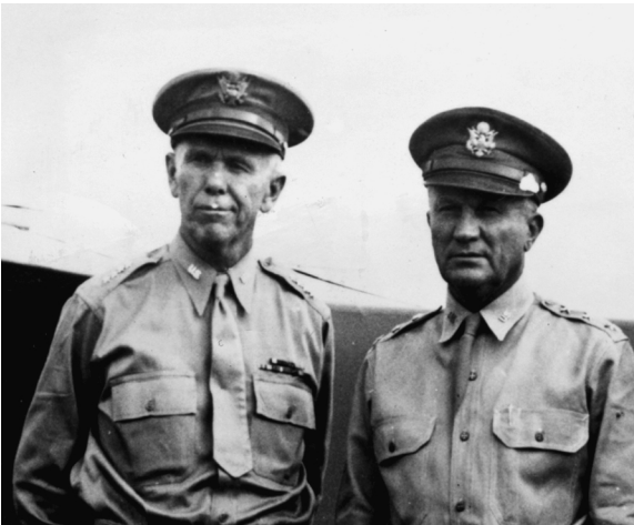
Gen. George C. Marshall (left) and Lt. Gen. Frank M. Andrews

If it takes three months to train an artilleryman and ten months to build a cannon, then you have got to have a reserve of cannon. But when it takes a year to build an airplane and up to three years to train