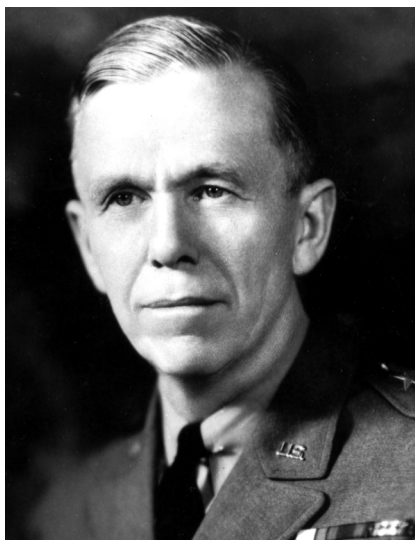
Gen. George C. Marshall

been in full agreement on anything. Nevertheless, Marshall prevailed and the appointment was announced. It was the first time in U.S. military history that an airman had been appointed one of the four assistant chiefs of staff on the Army General Staff.