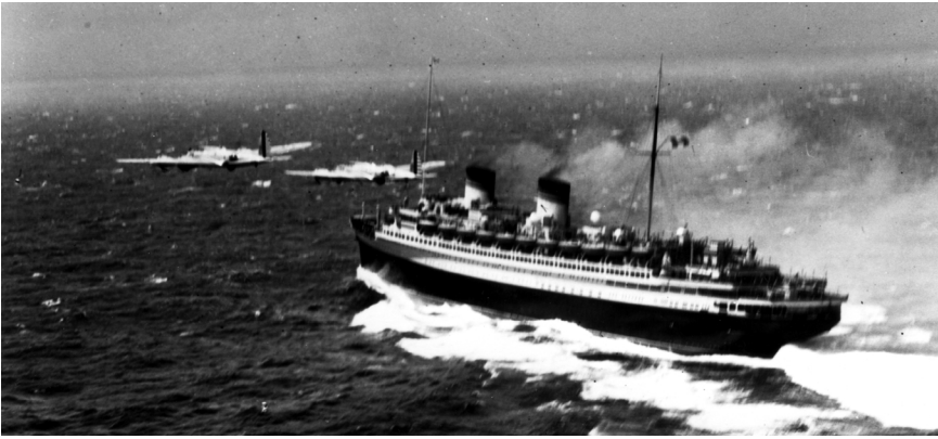
Two B-17s flying past the liner Rex , May 1938.

Andrews wrote: “The situation with reference to our strategic mission and the proper equipment with which to perform it, seems to be getting progressively worse, and we have no court of appeal that I can think of . . .” Then came the August 1938 meeting with Marshall. The War Plans Division Chief, upon returning from his nine days of air power indoctrination, found that, indeed, the airmen had no real representation on the General Staff. He was to become Andrews’s court of appeal.