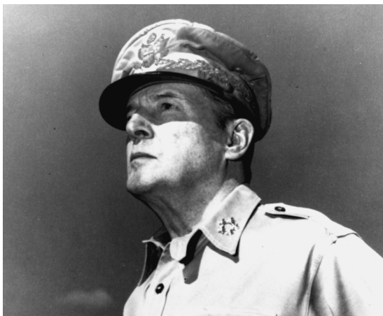
Gen. Douglas MacArthur

On May 23, 1934, even before the Baker Board had made known its recommendations, Andrews was ordered to report to the War Department to chair a committee that was, he told his father, “to make recommendations on organization of the Air Corps for greater mobility.” Serving with him were such keen thinkers as Spaatz, Hickam, Knerr, and Kenney. Their work was completed by mid-June. What they had created was the organizational structure for a combat air arm.