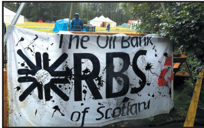
CLIMATE CHAOS: profit before the planet

Although most major governments in the world accept the reality of man-made climate change, they have been