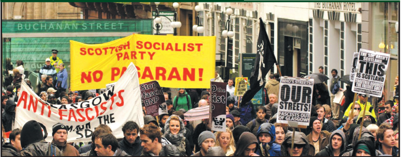
NO PASARAN: Hundreds of anti-fascists poured on to the streets last November in direct action to stop the SDL marching on Glasgow Central Mosque