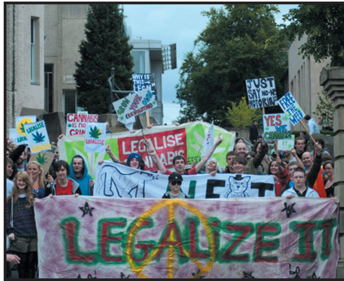
ACTION: SSY on the streets

The result of this is that the UK has some of the highest rates of drugs misuse in Europe, and huge rates of crime by people with problems forced into theft or prostitution to try and support their addiction.