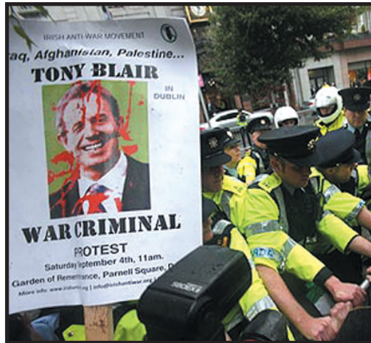
SIGNING: Blair was showered with eggs in Dublin by anti-war protestors at his book launch

Blair's autobiography has shot to the top of the bestseller list, breaking all previous records for sales of political and celebrity biogs. This is despite the fact that so far Blair's book has about as much regret, modesty and contrition as a coked up rockstar screwing his way through an army of groupies. Only two