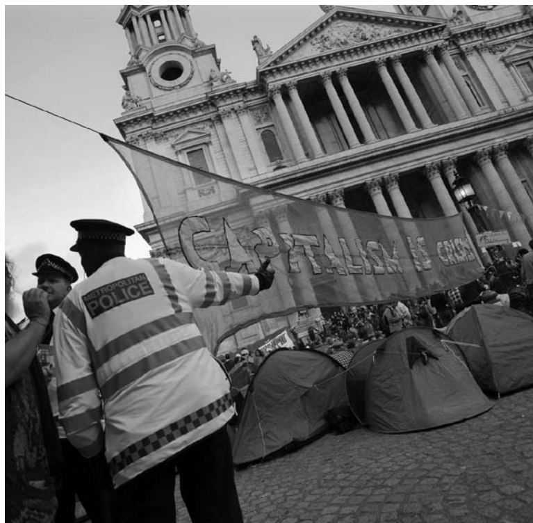
Outside St Paul's cathedral

An Occupy LSX camper spoke to the Socialist about the threat by St Paul's Cathedral and the City of London