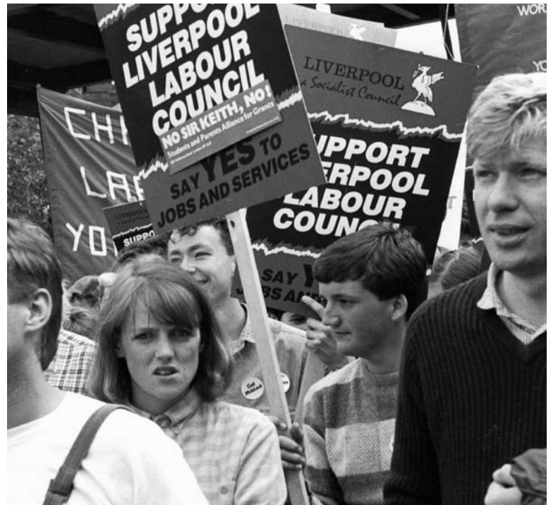
The Liverpool 47 council won massive support