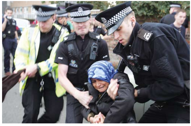
DAWN RAID. A woman is dragged away during a deportation raid in Glasgow in October 2006. UK Border Agency "enforcement teams" now do this work, making 585 similar early-morning "visits" between January and November 2010.

RIGHT NOW, OUT OF SIGHT, out of mind, in Britain, around 3,200 people who haven't harmed anybody are being held in 11 special prisons, not knowing what's going to happen to them, or when.