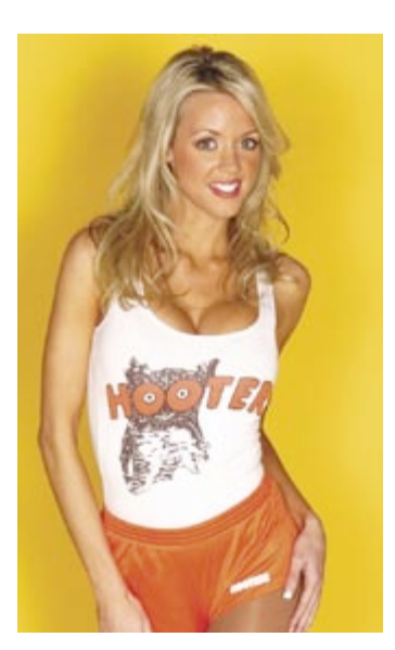
AFTER: A liberated and self-respecting British woman