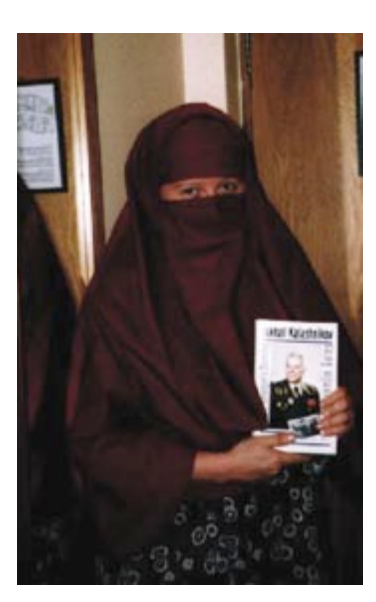
BEFORE: A poor oppressed foreign woman