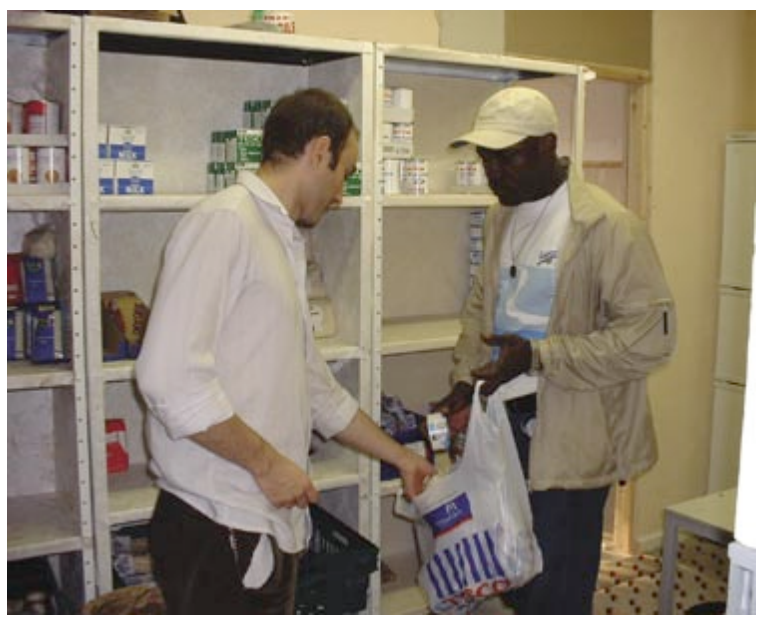
Heart-warming sight of a destitute asylum seeker receiving a Red Cross food parcel in world's fourth largest democracy

The Government admits that there is no safe passage home for Iraqis and Somali's but that hasn't stopped them from kicking in with the old destitution policies. Some extremist liberal terrorist types have argued the sort of policy that leaves young children with no roof over has no place in democracy but I say go the whole hog - shut off their air supply.