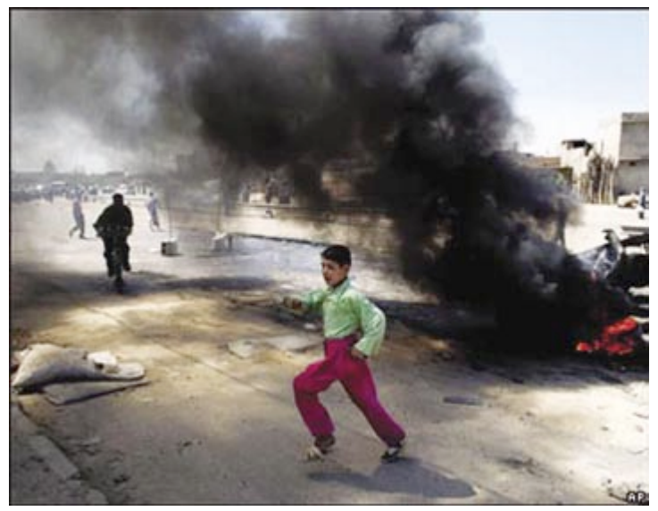
All smiles - children, drunk with freedom ^{TM} , cavort in the streets of downtown Baghdad

Read the glowing testimonial of our customer, Mr X from Zimbabwe: "They really laid it out for me. Why, on my arrival back in Zimbabwe they'd even arranged a local welcoming committee for me at the airport and secure accommodation within the airport itself.