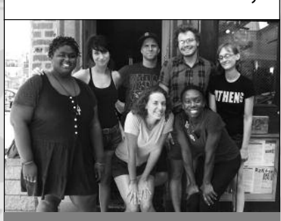
The Books Through Bars Collective today