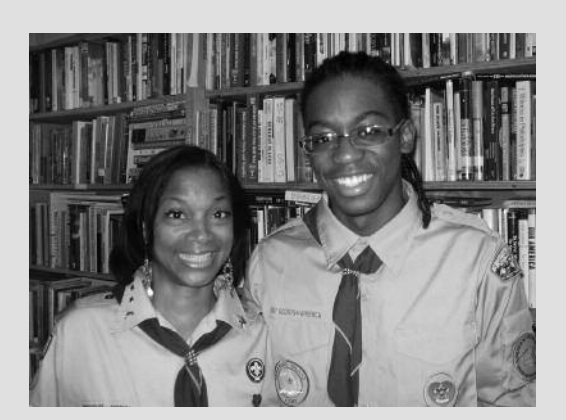
Eagle Scout Works to Help BTB

BSM: The youth always come away from an experience at BTB thinking differently about those who are incarcerated. The comments all point to a humanizing in their mind of a group of people that is regularly denied humanity. This transformation plays out in comments about handwriting, taste in books, or how polite the tone of the letter is. Further, the youth get a sense of connection to the people writing letters as they search to find books that the letter-writer will like. We always had such a wonderful experience at BTB and we're very grateful to have you as community partner.