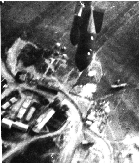
Airfield attacks were an important element of the German OCA efforts. German bombs fall on an English airfield, summer 1940.

Force was virtually annihilated in a series of powerful attacks against Soviet airfields. Conditions were favorable for the Luftwaffe's OCA "knock-out blow." Soviet airfields were incomplete, increasing the vulnerability of Red aircraft on the ground. Soviet units that made it into the air were quickly swept aside as inferior Red Air Force equipment, training, and organizations were exposed. German armored units overran Soviet bases, dislocating or annihilating Red air units. Air superiority was quickly achieved and the Luftwaffe was able to shift its efforts to interdiction and close air support. During the period of unquestioned German air superiority, however, the Wehrmacht was unable to bring about a decision in the war. The sources of Soviet airpower were shifted out of range (east of the Urals) and the Red Air Force began a slow recovery. During the Battle of Moscow, the Soviets were able to bring previously uncommitted Siberian air and ground units to bear as the Luftwaffe was severely hampered by the winter conditions. After Moscow, the Red Air Force grew steadily as the Luftwaffe withered. The immensity of the Eastern Front swallowed the small Luftwaffe. Unable to cover vast sections of the front, air units had to be concentrated at critical points. Concentration was crucial in the battles for local air superiority, but it provided no guarantees of success. In the skies west of Stalingrad, the Red Air Force and winter weather foiled the German attempts