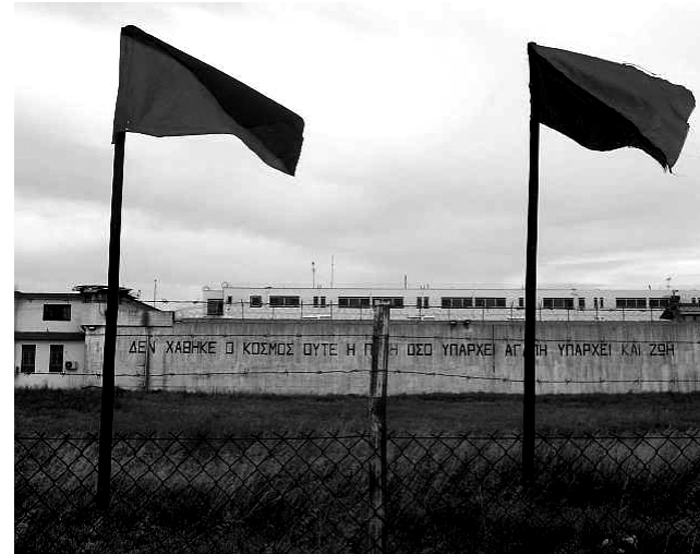
Greece: Anarchist flags fly at a solidarity demo outside Diavata prison in Salonica.

Keith McDay 04 A-4724 Southport CF PO Box 2000 Pine City, NY 14871