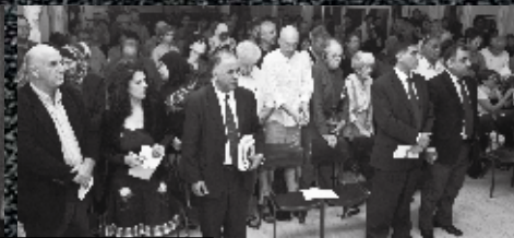
Two minutes of silence for our loved ones