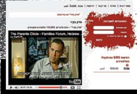
Crack in the Wall internet site

2010 has been dedicated in many ways to the creation of the “Crack in the Wall” project which will be launched in the first part of 2011. This innovative and groundbreaking social media project allows Israelis and Palestinians to engage, to express their views, tell their stories, talk and get to know one another virtually and maybe eventually in person. The project was born out of the success of the PCFF’s Hello-Shalom Project launched in 2002 - a toll free telephone line between Israelis and Palestinians. The incredible boom in technological innovation and new media has created an exponential growth in opportunities for individuals to engage with each other. We are therefore upgrading this project to include SMS text messaging, Facebook, Twitter and an interactive Community Website. By using the tools for social media, Palestinians and Israelis and indeed the whole world will be able to cross hitherto forbidden borders.