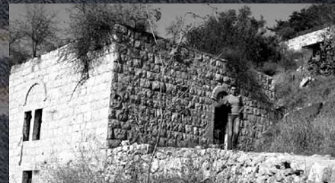
Grannies Sharing three generations of memories The Ghost Town of Lifta. A poignant memory from 1948