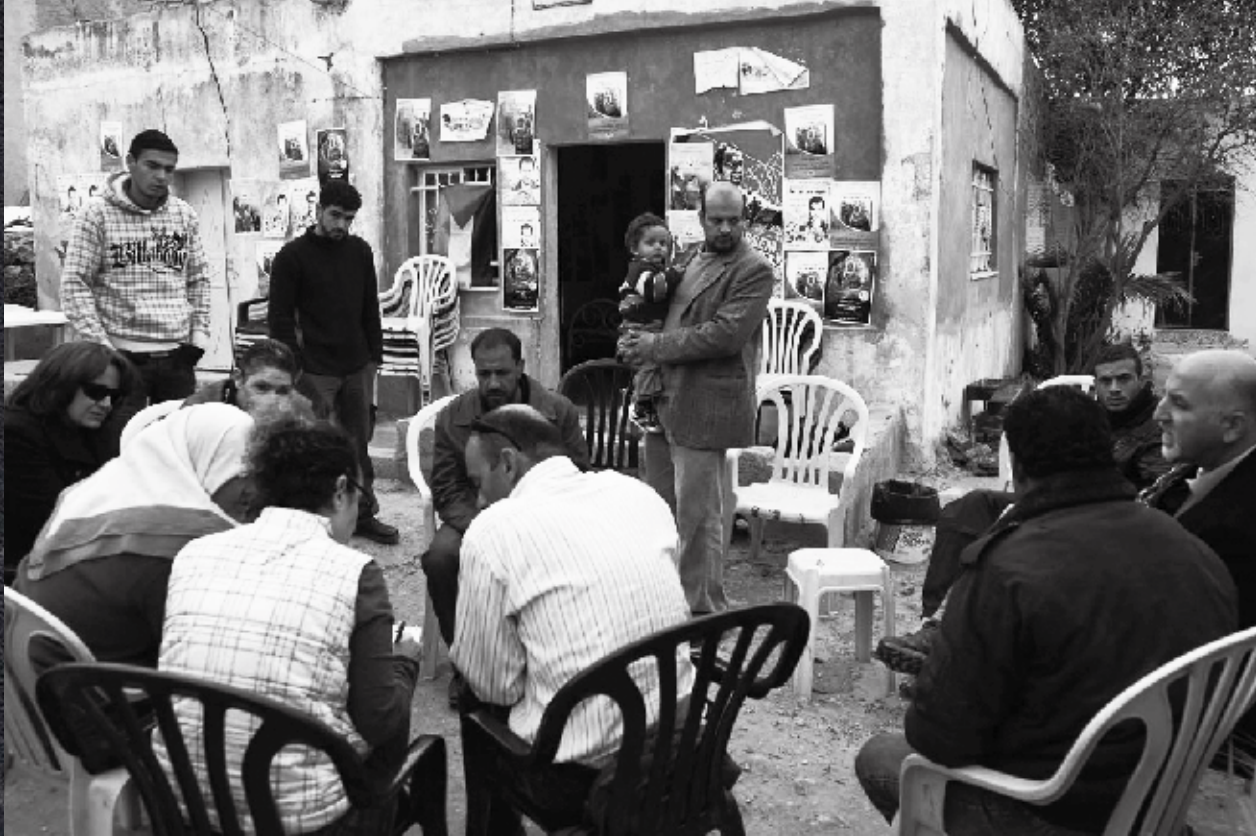
Condolence Visit to bereaved family Abu Rachme in Bil'in on the West Bank