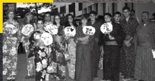
Delegation of Israeli and Palestinian youth to Japan