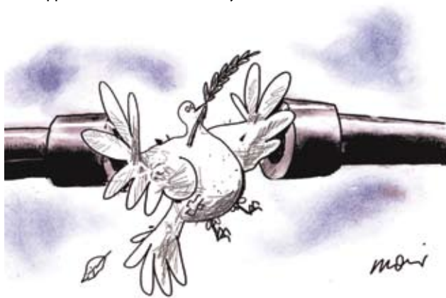
Alan Moir, Australia

This special exhibit created by the PCFF together with Israel's most famous cartoonist, Michel Kichka as curator, has continued to wow audiences all over the world in 2010. The Exhibition has been to Austria, the Edinburgh Festival, Belfast, Madrid, Seville, Hamburg and Holland. We continue to receive requests from all over the world for this exhibit. In 2009, it was shown in Israel, Spain, London, Italy and New York. The exhibition attracted a huge response from the media and we have appeared on television at every venue.