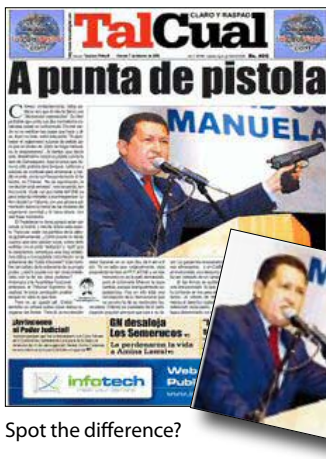
Spot the difference?

Teodoro Petkoff, who was once a leftist, joined the Caldera government in the 1990s, where he was in charge of the privatisation of most state owned companies, following the diktats of the IMF. He supported the April 2002 coup against president Chávez and published a famous editorial entitled "Chao Hugo" celebrating his undemocratic removal. He is one of the main leaders of the opposition and acted as the main advisor to the opposition presidential candidate Manuel Rosales in the December 2006 elections. Petkoff concludes his editorial with this statement: "Chávez has started to walk, now for real, the path to a dictatorship. Will the country swallow it?" This sounds like a very ominous threat, particularly coming from someone who supported the coup in April 2002 and has played a role in every single undemocratic plot of the reactionary opposition to remove Chávez and put an end to the Bolivarian revolution. The problem in Venezuela, clearly, is not one of lack of freedom of expression, but one of incredible and dangerous leniency with the sworn enemies of the democratic will of the people.