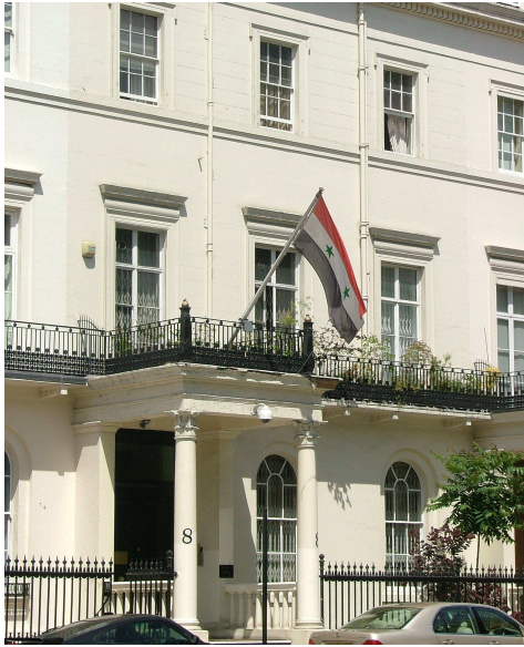
The Syrian embassy in London.