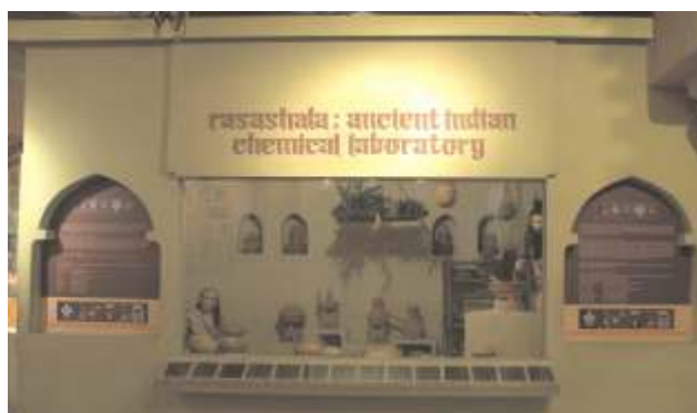
Fig. 5. Exhibit showing a typical period setting of an ancient chemical laboratory the Rasashala

Alchemy (the older form of chemistry) is another area in which ancient Indians made profound contributions 13 . It is interesting to note that Joseph Needham claims that earliest distillation of alcohol can be traced back to the archaeological finds at Taxila 14 . Much of ancient chemistry in India grew out of the early efforts to develop an elixir and to turn base metals into gold. The Indian alchemy had two characteristic streams: gold making and elixir synthesis. The two faces of the alchemical practice, the metallurgical and the physico-religious, were superimposed to get a single picture wherein mercury and its elixirs were used in the so-called transmutation of the base metals into noble ones, as well as for internal administration for purifying the body, rejuvenating it and taking it to an imperishable and immortal state. The earliest available documented alchemical text in Sanskrit, Rasaratnakara by Nagarjuna was probably part of a larger text Rasendramangala written by the same author. Nagarjuna was the most prominent scholar in the field of Indian alchemy. Rasashala (fig 5), a typical