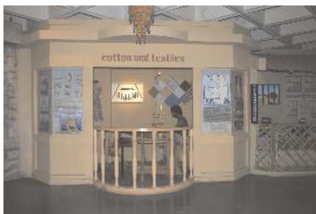
Fig 9. Exhibit display showcasing ancient Indian cotton and textiles with information on cotton-gin and also a model of the same in the inset along with other display

the significance of cotton, cotton-gin and also the rich traditional textile heritage that India has. The exhibit also houses a model/replica of an ancient cotton gin made from the references of Needham's book.