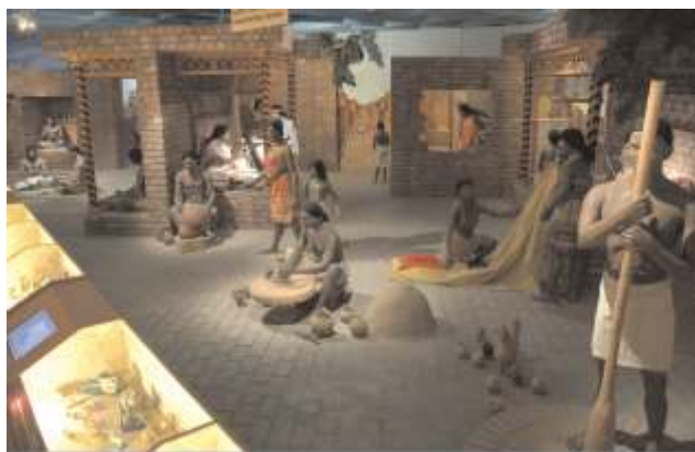
Fig. 3. A general view of the Harappans diorama showing different technological practices of the Indus people

The next section in the gallery (Fig 3) portrays in a period setting, with artistic elegance, the technological developments of the Indus Valley Civilization. It is for this reason that Harappans have