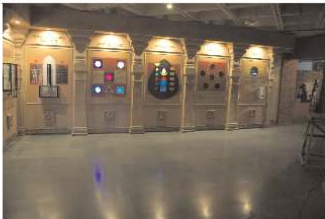
Fig 4. A general view of the section on Ancient Indian Philosophical concepts and contributions in mathematics

important idea that appears so simple now that we tend to ignore its true merit. George Sarton, the renowned historian of science, known for his work, Ancient science through the golden age of Greece , Cambridge, Harvard University Press, 1952, has observed: Our numbers and the use of zero were invented by the Hindus and transmitted by Arabs; hence the name Arabic numerals which we often give them. Al-Khwarizmi (9 th century AD), a Central Asian mathematician who worked in Baghdad, played a crucial role in transmission of the Hindu works to the western world through his seminal work on arithmetic. Al-Biruni (11 th Century AD) 12 was another exponent not only of the Hindu numerical system, but also of Indian astronomy. Other important Indian contributions that have been adequately covered in this section of the gallery include calculation of the value of pi, and calculating the square and cube roots of numbers, the golden rule of three, Brahma Gupta's important contribution in the solution of second order indeterminate equation that was later recognized by Europe as the Pell's equation. His lemmas in this connection were rediscovered by Euler (1764) and Lagrange. The so-called Pythagoras theorem also seems to have been worked out by the Indians as evidenced in the Sulbasutra treatises and therefore the exhibition also covers this aspect which also has been presented in an interactive manner.