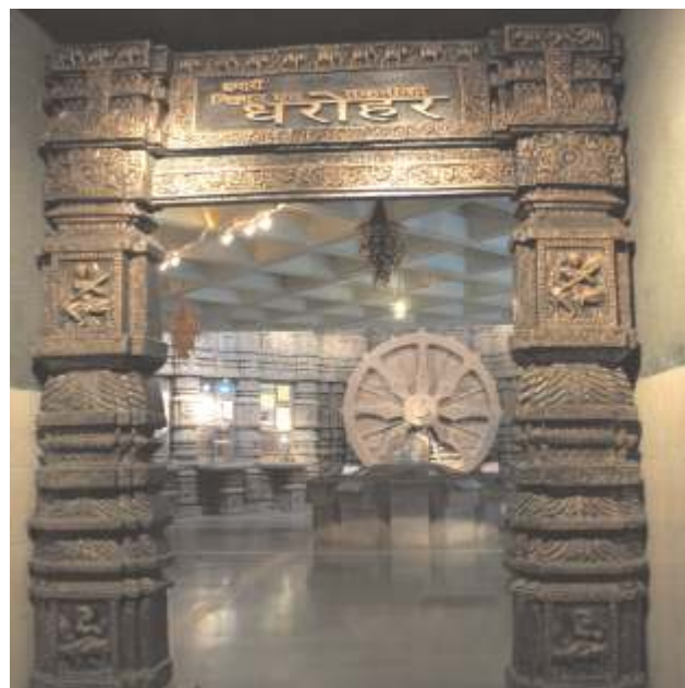
Fig.1 The entrance view of the gallery showing inset display of the section on ancient astronomy

The gallery starts with a presentation that is a wonderful mix of both the science centre and museum approach (Fig1&2). A large size mural