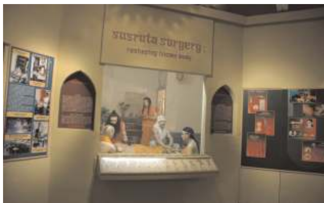
Fig 7 Diorama showing a typical surgical laboratory of Sushruta, with supporting information and display materials

Of the several media coverage that the gallery received in the print and electronic media one that stands out is the coverage on Sushruta's surgery. Just after the inauguration of the gallery a press correspondent from AFP, of all things from the gallery, picked up the Nose Job of Sushruta and filed his report and his report was picked up and published by several international and Indian print medias 16 and the coverage credited India (Sushruta) to be the first to carry out the plastic surgery with specific reference to the rhinoplasty, besides touching upon the other highlights of the gallery.