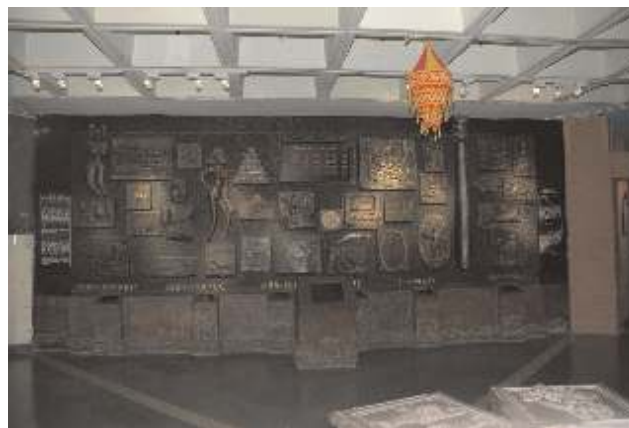
Fig. 2. Time line of our S&T Heritage mural exhibit in the entry area showing 6 landmark time lines with supporting digital photo frames and a touch screen multimedia