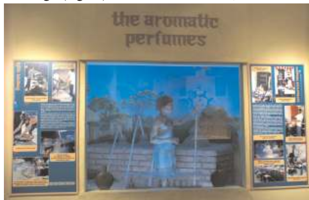
Fig. 6. Diorama depicting the ancient Indian perfume making process using the reverse hydro distillation techniques

alchemical laboratory of Nagarjuna which is portrayed in the Gallery, shows a number of special types of yantras , used for different chemical purposes like distillation ( patanayantra ). One of the most important yantras the tiryakapatanayantra (reverse distillation) was used in zinc smelting and also in the perfume making (fig 6). In ancient India, there was