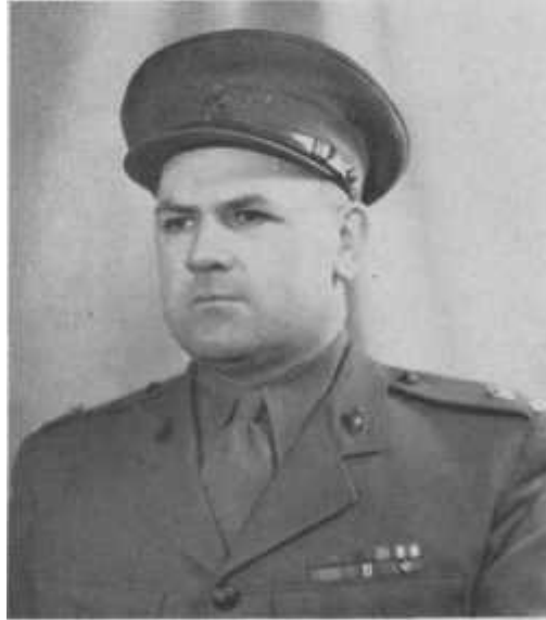
HON.-MAJ. JOHN W. FOOTE, V.C.