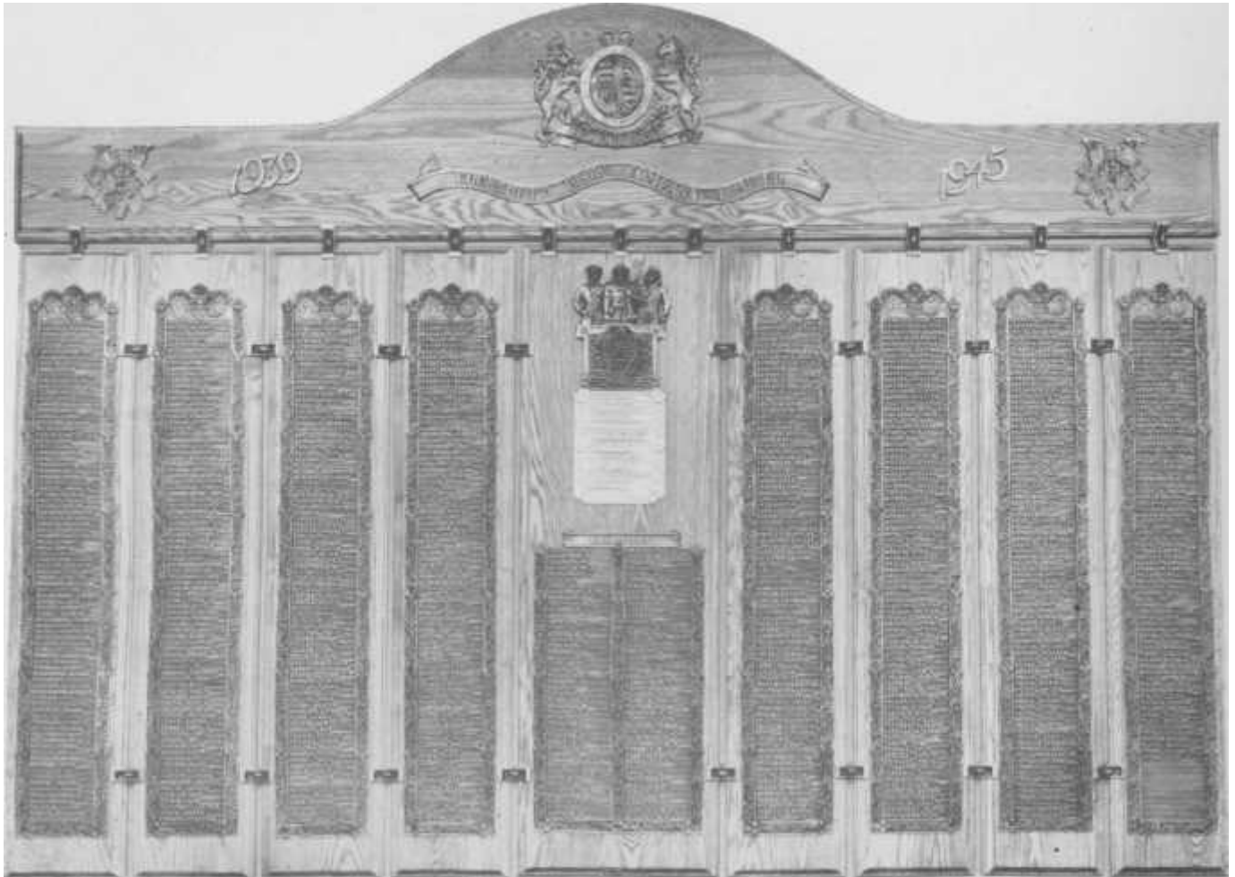
THE COCKSHUTT HONOUR ROLL AT THE COMPANY'S HEAD OFFICE

In association with the citizens of Brantford and Brant County we salute the men and women of this city and vicinity who served the cause of freedom in World War II. Among them were many hundreds of our own employees who chose the more dangerous paths of duty and whose presence in the Armed Forces gave added incentive to the Company's production of the implements of war. Their service and sacrifice high lighted a common contribution to the achievement of final victory.