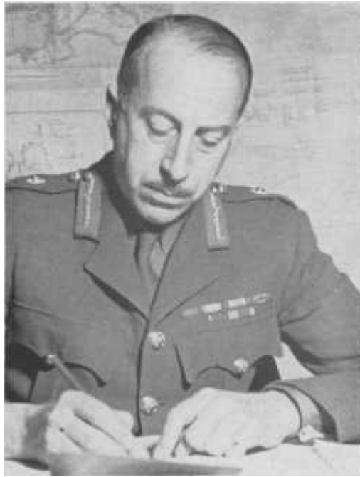
GENERAL H. D. G. CRERAR, C.H., C.B., D.S.O.

I have been asked to write a foreword to the Album of Honor, which is being published by the Kinsmen Club of Brantford to commemorate those of that locality who served in the Armed Forces of Canada during the Great War 1939-45.