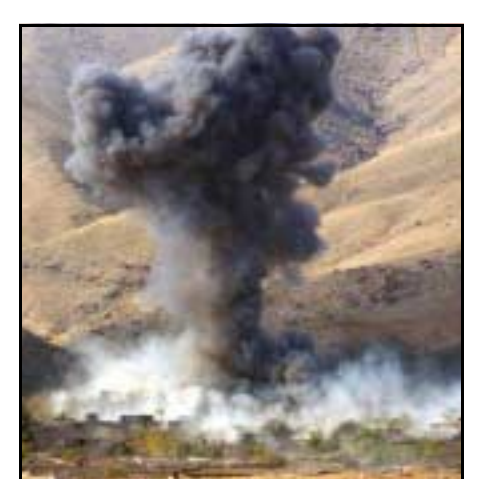
"Collateral damage": US bomb hitting residential area.

"Art. 51. Nothing in the present Charter shall impair the inherent right of individual or collective self-defense if an armed attack occurs against a Member of the United Nations, until the Security Council has taken measures necessary to maintain international peace and security. Measures taken by Members in the exercise of this right of self-defense shall be immediately reported to the Security Council and shall not in any way affect the authority and responsibility of the