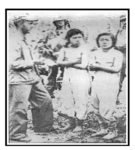
Korean women were victims of rape by US soldiers.

3. The Members find that in the period from July 1953 to the present, the U. S. has continued to maintain a powerful military force in southern Korea, backed by nuclear weapons, in violation of international law and intended to obstruct the will of the Korean people for reunification. Military occupation has been accompanied by the organized sexual exploitation of Korean women, frequently leading to violence and even murder of women by U.S. soldiers who have felt above the law. U.S.-imposed economic sanctions have impoverished