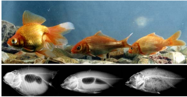
Figure 2. Cross-species clone. The nucleus of a common carp, Cyprinus carpio , (middle) was transferred into the enucleated egg cell of a goldfish, Carassius auratus (left). The result is a cross-species clone (right) with a vertebral number closer to that of a goldfish (26-28) than of a carp (33-36) and with a more rounded body than a carp. The bottom illustrations are X-ray images of the animals in the top illustration. Figure kindly provided by Professor Yonghua Sun from the work of Sun et al (2005).