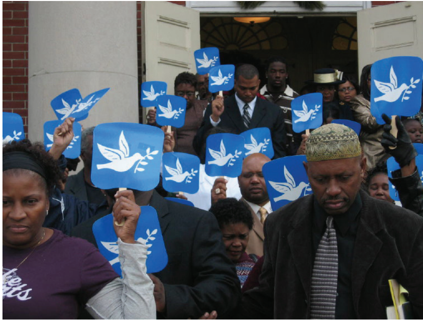
ABOVE: Supporters pour out of Waton Memorial during Amnesty Weekend.

Executive pardon has been interpreted by the Supreme Court of Louisiana as restoring “the pardoned individual [to] a status of innocence of crime.” 72 A grant of pardon allows for the destruction of all records of arrest and conviction for the pardoned individual, so that the negative effects of having a criminal record, such as being barred from employment, housing, educational assistance, social welfare benefits, holding certain licenses (such as for many employment opportunities in health care or to sell liquor), or serving