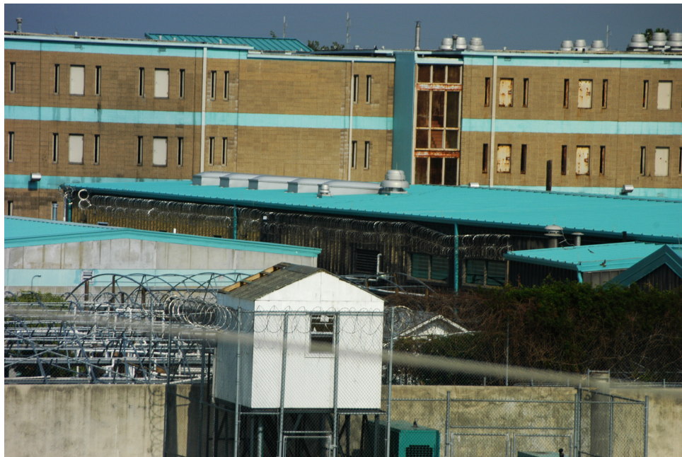
ABOVE: Orleans Parish Prison

freedoms are violated and ICCPR's mandate that parties to the treaty ensure an effective remedy for anyone whose enumerated rights are violated. In the past, Amnesty has been used to expose and recognize human rights violations and promote reconciliation amongst impacted parties and those responsible for the abuses.