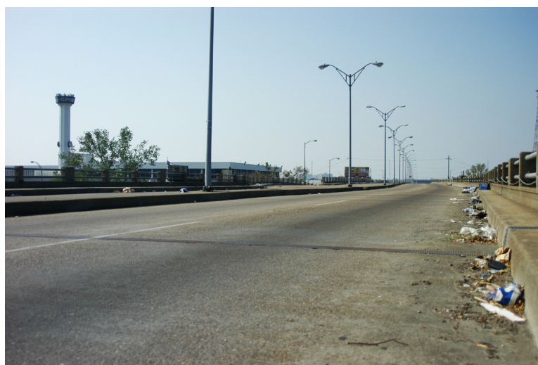
ABOVE: Broad Street bridge, where thousands of prisoners were left for days.